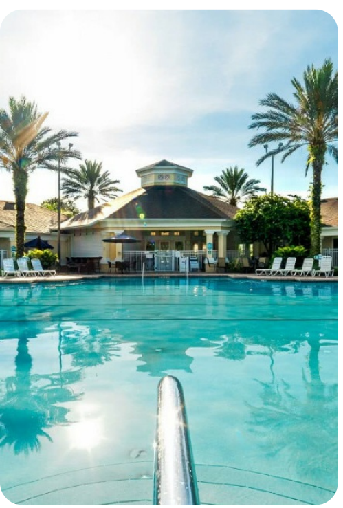
Windsor Palms Resort 130 | Page 6 of 8