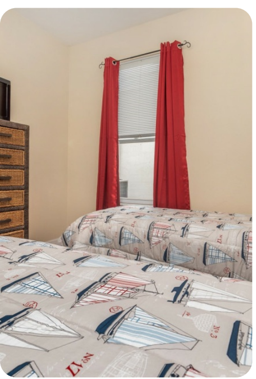
Windsor Palms Resort 130 | Page 5 of 8 \,