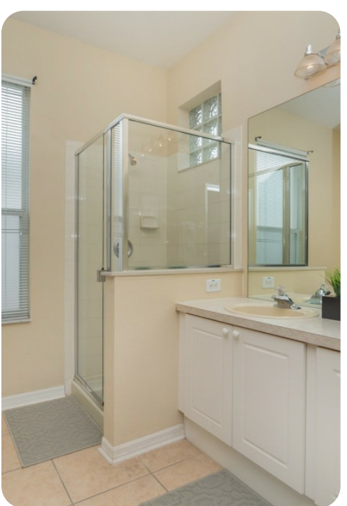
Windsor Palms Resort 130 | Page 3 of 8