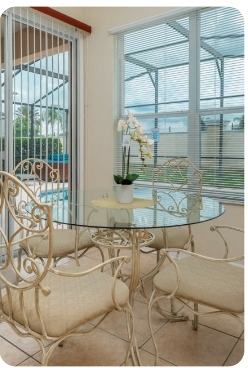
Windsor Palms Resort 130 | Page 2 of 8