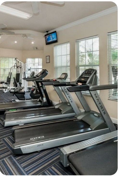
Windsor Palms Resort 130 | Page 8 of 8