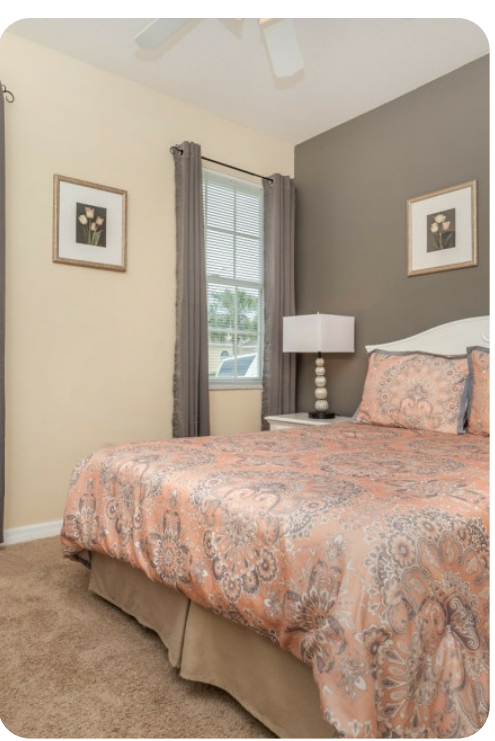
Windsor Palms Resort 130 | Page 4 of 8