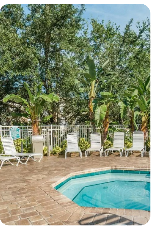
Windsor Palms Resort 130 | Page 7 of 8