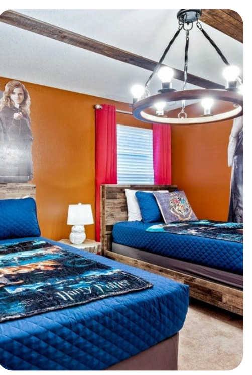
Windsor Island Resort 98 | Page 6 of 8