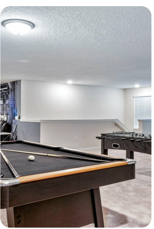
Windsor Island Resort 98 | Page 4 of 8