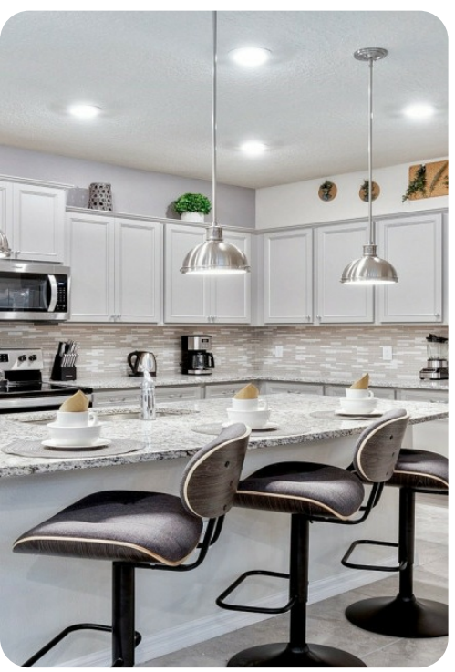
Windsor Island Resort 98 | Page 3 of 8