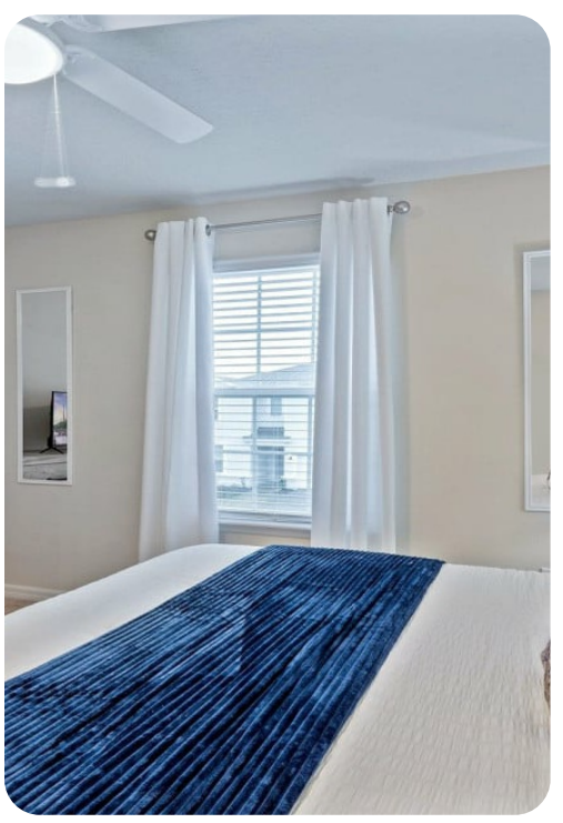
Windsor Island Resort 98 | Page 7 of 8