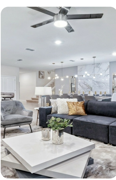
Windsor Island Resort 98 | Page 2 of 8