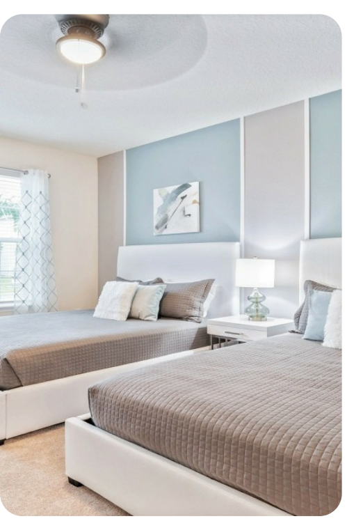
Windsor Island Resort 98 | Page 5 of 8