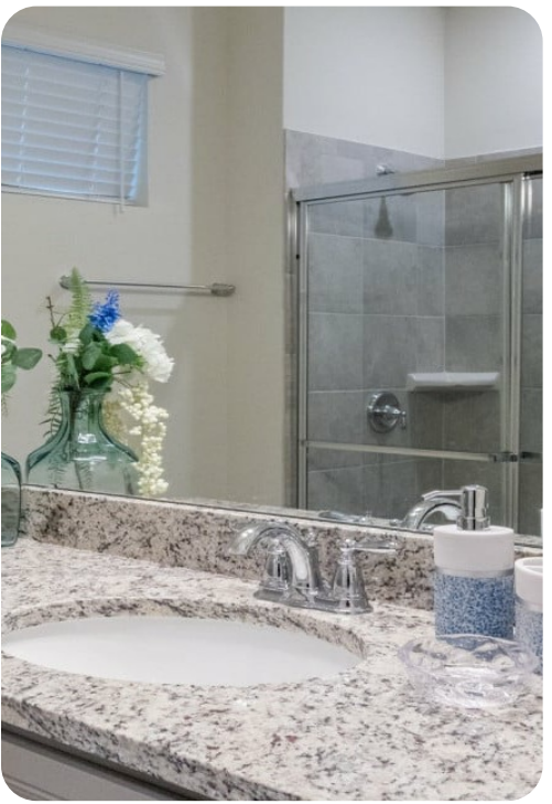
Windsor Island Resort 98 | Page 8 of 8