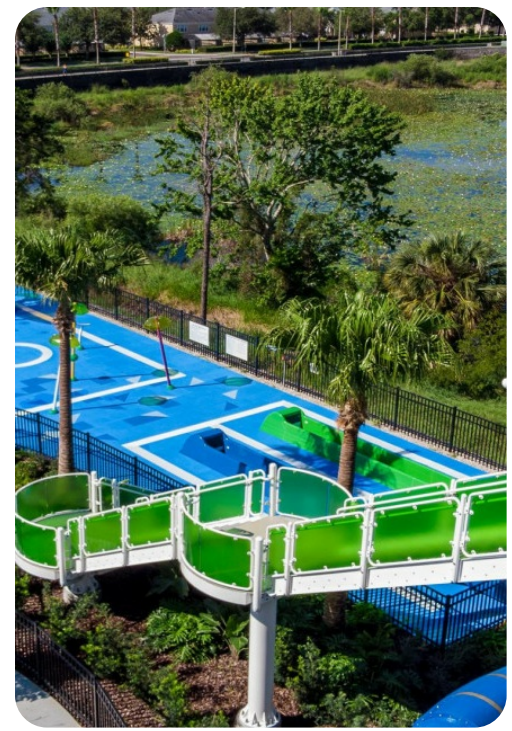
Windsor Hills Resort 1017 | Page 4 of 8