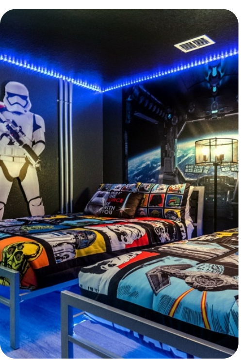
Windsor Hills Resort 1017 | Page 8 of 8