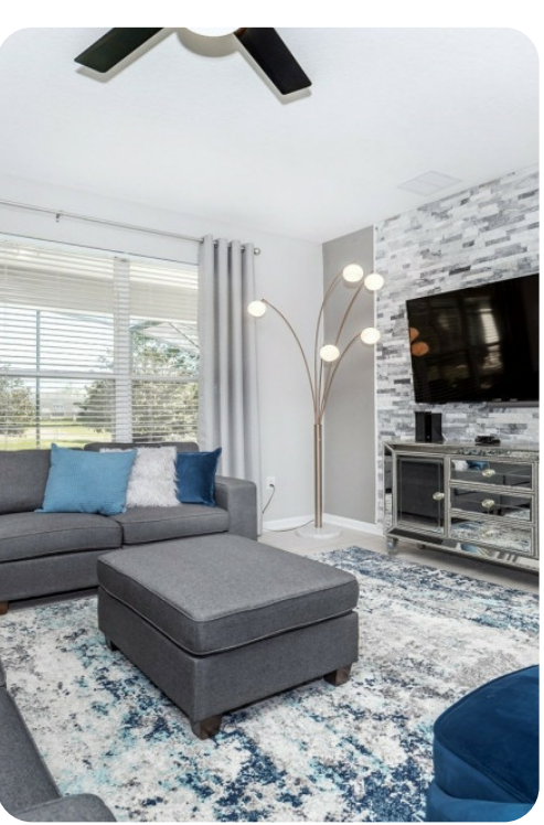
Windsor Hills Resort 1017 | Page 6 of 8