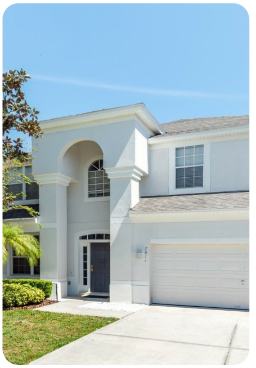
Windsor Hills Resort 1017 | Page 5 of 8