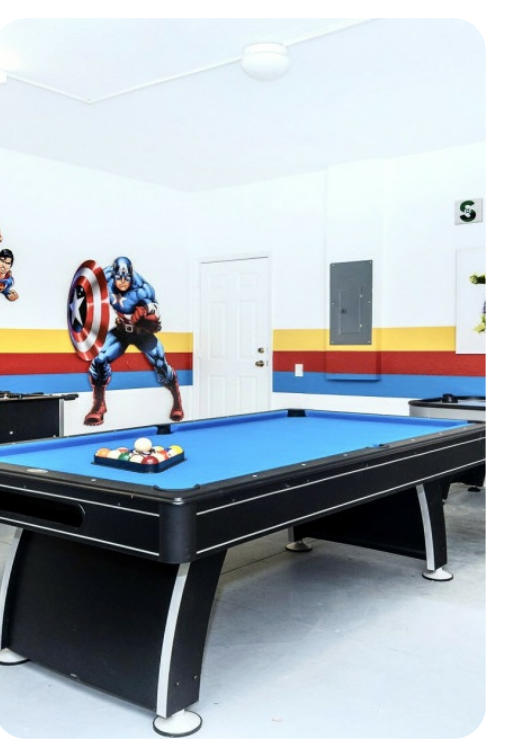
Windsor Hills Resort 1017 | Page 7 of 8