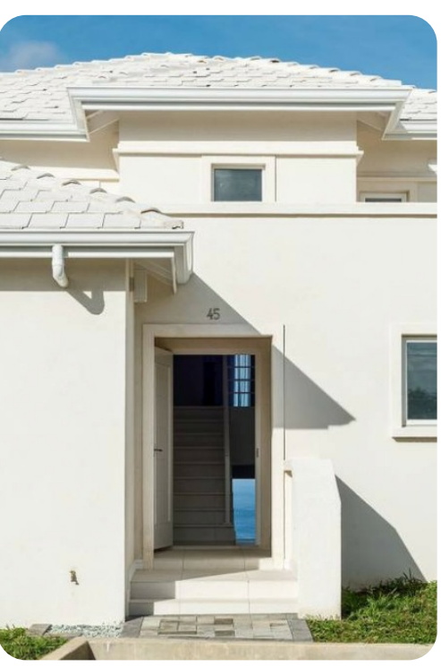
Westmoreland Hills 45 - Sundowner Villa | Page 6 of 6