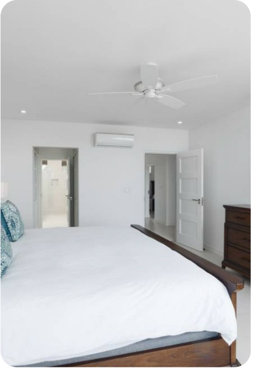
Westmoreland Hills 45 - Sundowner Villa | Page 4 of 6