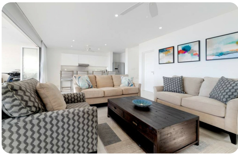
Westmoreland Hills 45 - Sundowner Villa | Page 1 of 6