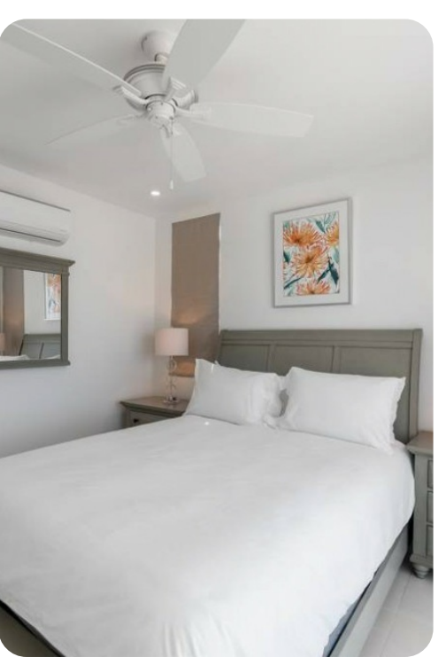
Westmoreland Hills 45 - Sundowner Villa | Page 5 of 6