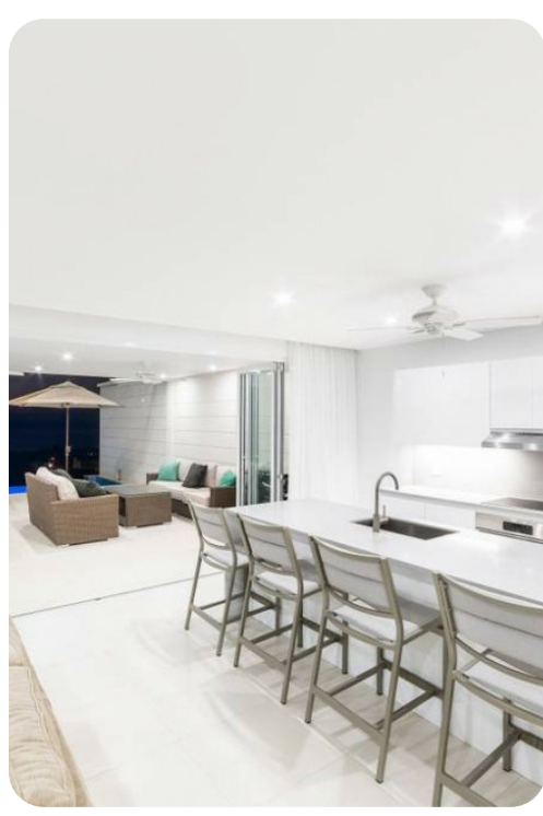
Westmoreland Hills 45 - Sundowner Villa | Page 2 of 6