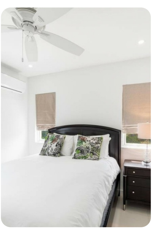
Westmoreland Hills 45 - Sundowner Villa | Page 3 of 6