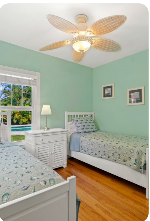
West Palm Beach 20 | Page 4 of 7