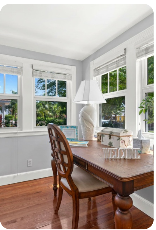
West Palm Beach 20 | Page 2 of 7