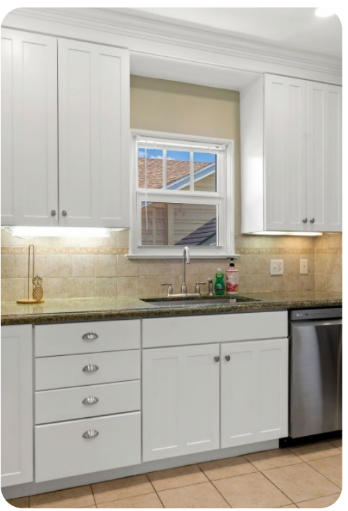
West Palm Beach 20 | Page 3 of 7