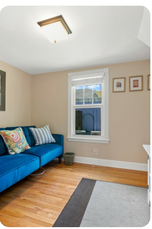
West Palm Beach 20 | Page 5 of 7 \,