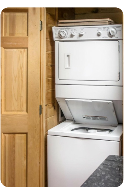
Wears Valley 3 | Page 6 of 8