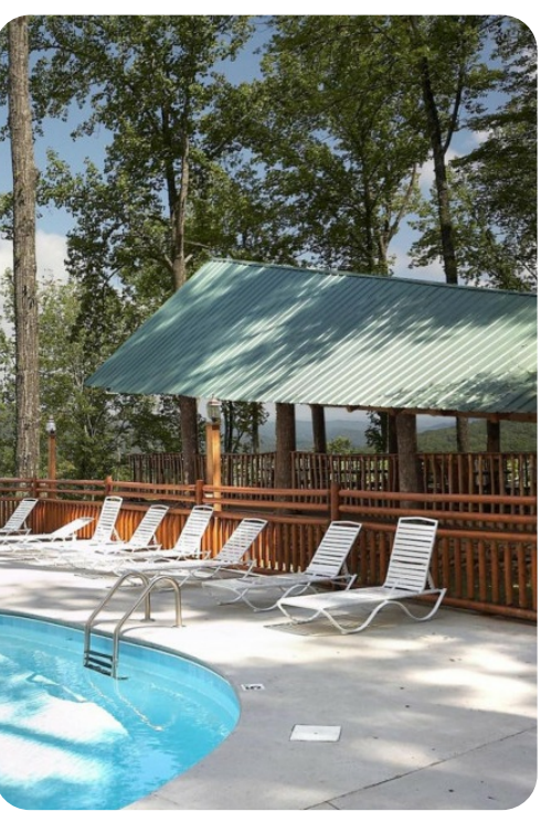
Wears Valley 3 | Page 8 of 8