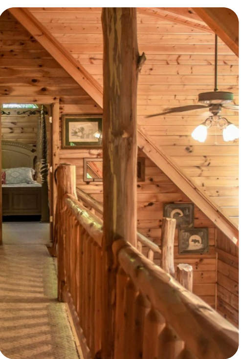
Wears Valley 3 | Page 4 of 8