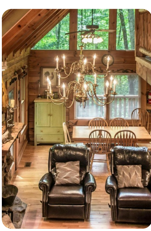
Wears Valley 3 | Page 2 of 8