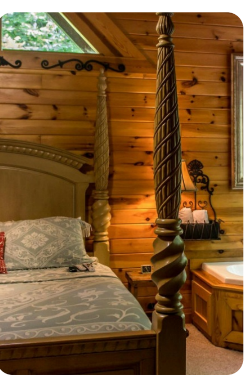
Wears Valley 3 | Page 5 of 8