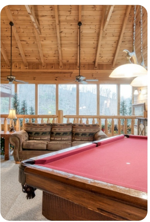
Wears Valley 1 | Page 5 of 8