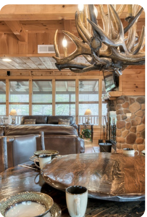
Wears Valley 1 | Page 3 of 8