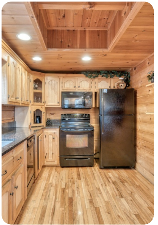
Wears Valley 1 | Page 4 of 8