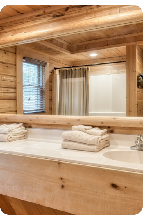
Wears Valley 1 | Page 6 of 8