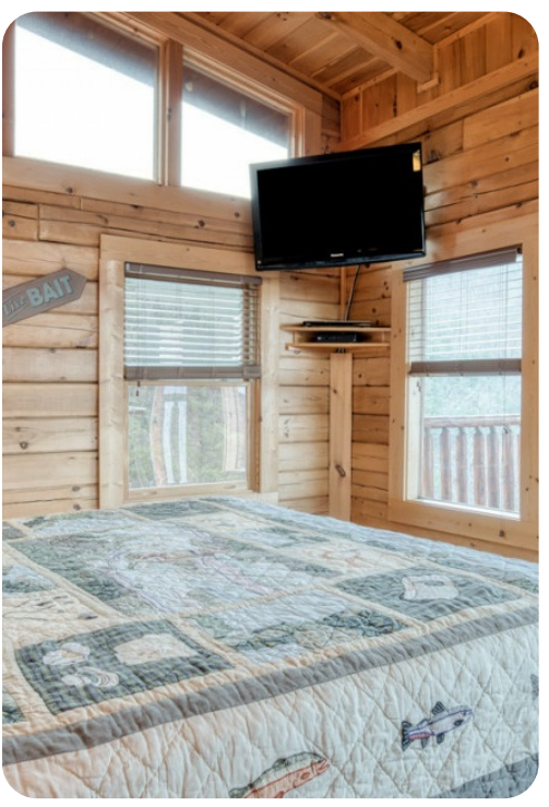
Wears Valley 1 | Page 8 of 8