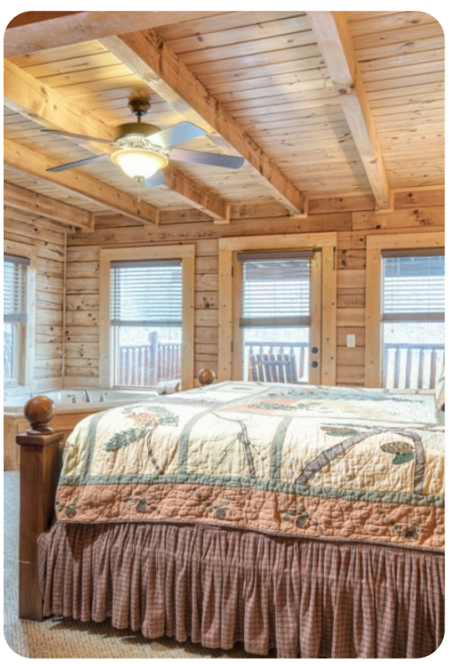
Wears Valley 1 | Page 7 of 8