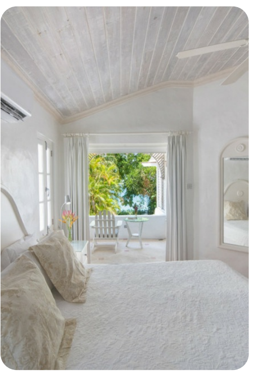
Waverly House | Page 3 of 4