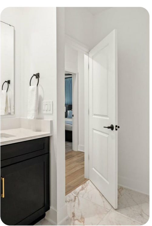
Villatel Orlando Resort 63 | Page 6 of 8