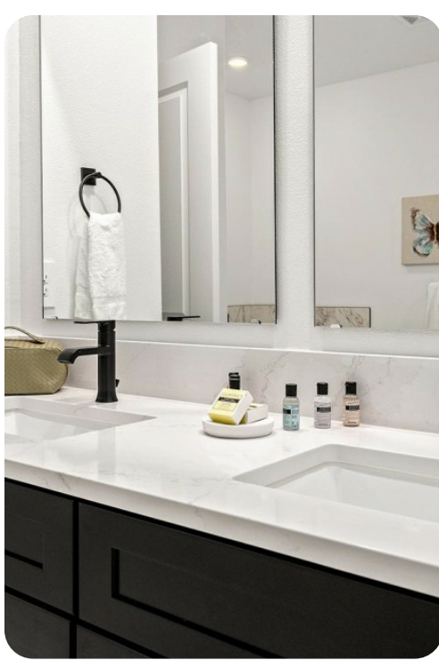
Villatel Orlando Resort 63 | Page 4 of 8