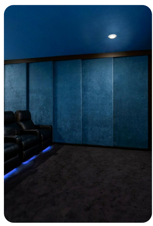
Villatel Orlando Resort 63 | Page 3 of 8