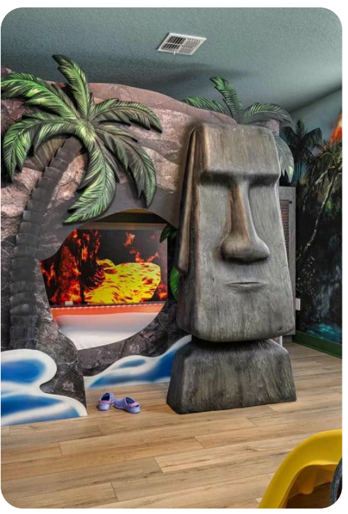
Villatel Orlando Resort 63 | Page 8 of 8