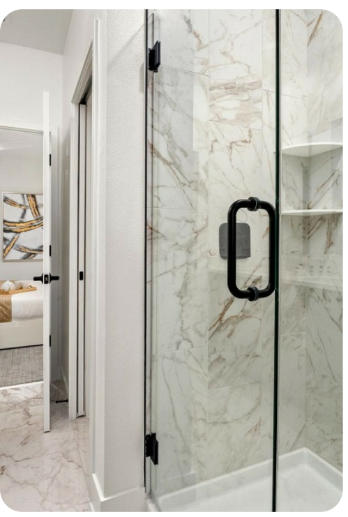
Villatel Orlando Resort 63 | Page 7 of 8