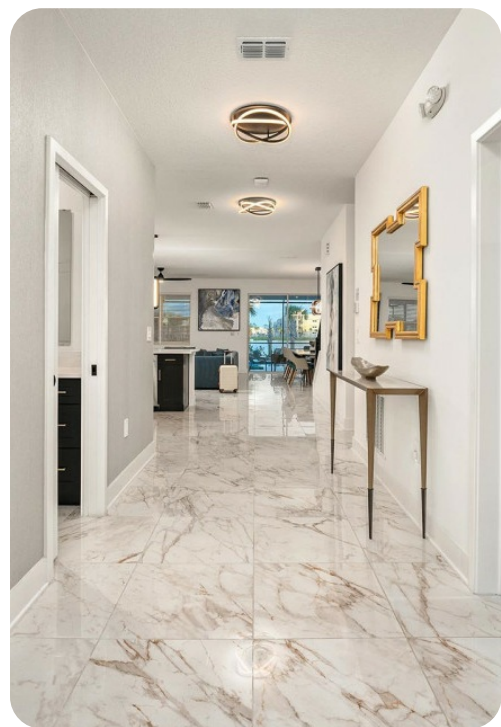
Villatel Orlando Resort 63 | Page 2 of 8