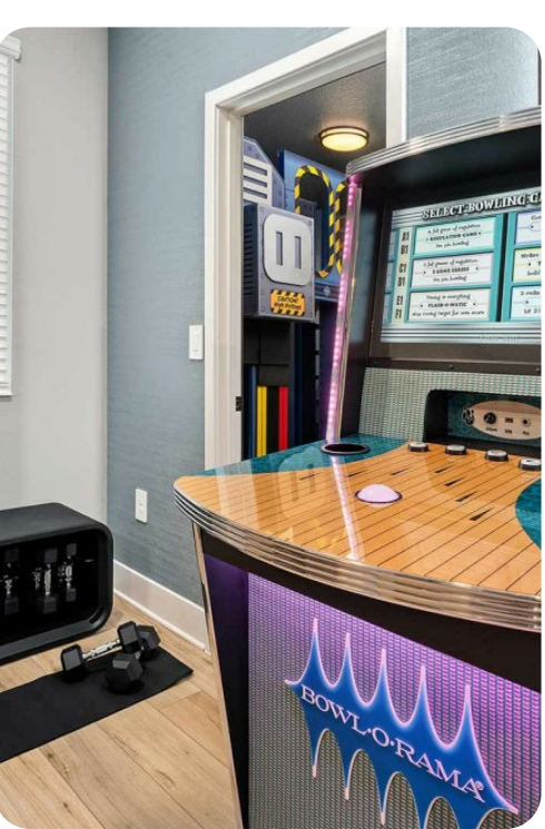
Villatel Orlando Resort 63 | Page 5 of 8