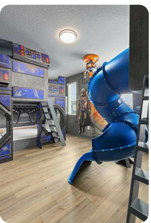
Villatel Orlando Resort 48 | Page 8 of 8