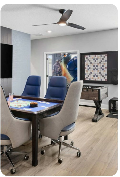
Villatel Orlando Resort 48 | Page 5 of 8