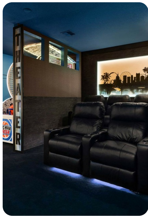
Villatel Orlando Resort 48 | Page 3 of 8