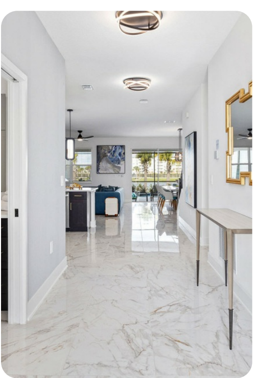
Villatel Orlando Resort 48 | Page 2 of 8