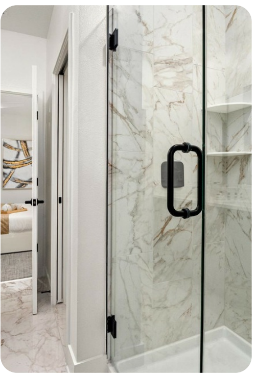
Villatel Orlando Resort 48 | Page 7 of 8