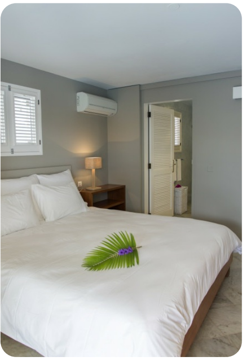
Villa Xanadu | Page 5 of 8