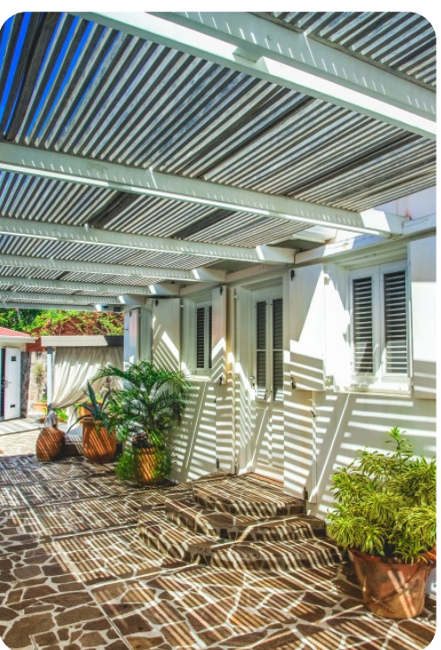
Villa Xanadu | Page 7 of 8