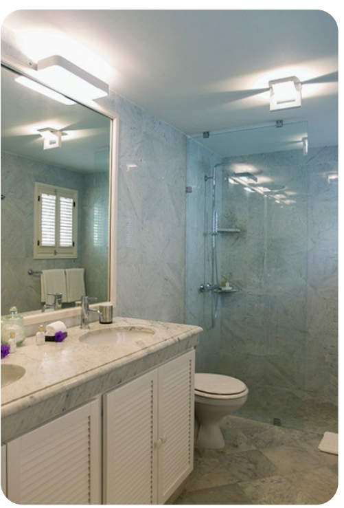
Villa Xanadu | Page 6 of 8