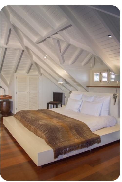
Villa Xanadu | Page 4 of 8