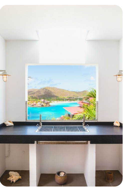
Villa Xanadu | Page 3 of 8