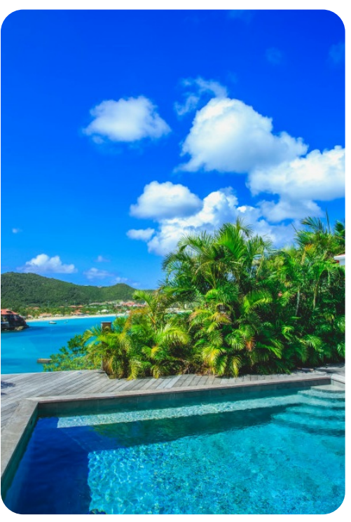
Villa Xanadu | Page 8 of 8