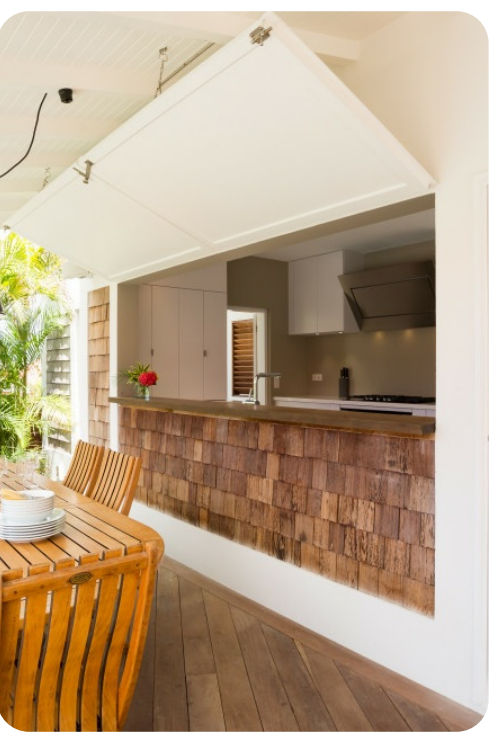
Villa Xanadu | Page 2 of 8