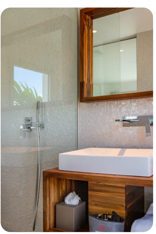
Villa Wine Note | Page 7 of 8