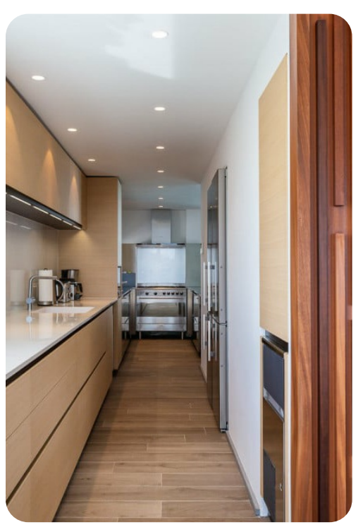
Villa Wine Note | Page 3 of 8