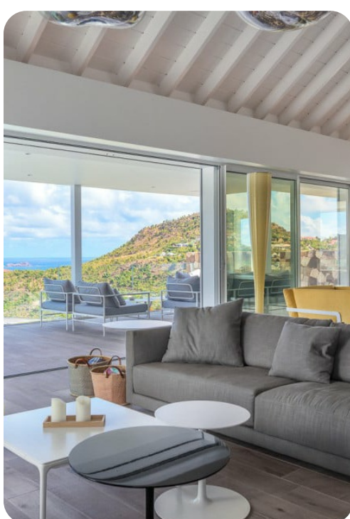
Villa Wine Note | Page 2 of 8