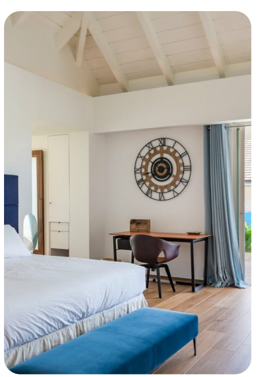
Villa Wine Note | Page 4 of 8