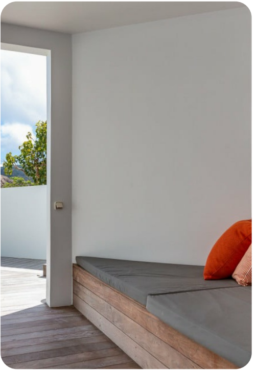
Villa Wine Note | Page 6 of 8