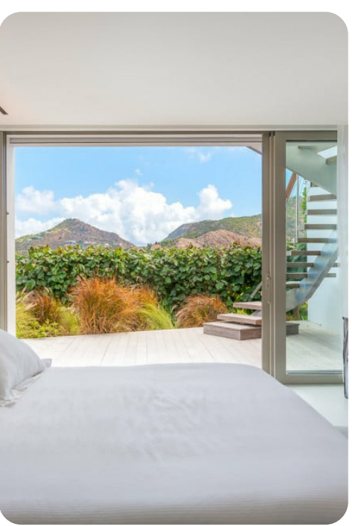
Villa Wine Note | Page 8 of 8