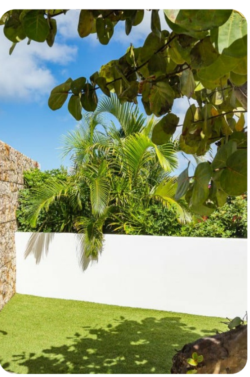
Villa Wine Note | Page 5 of 8