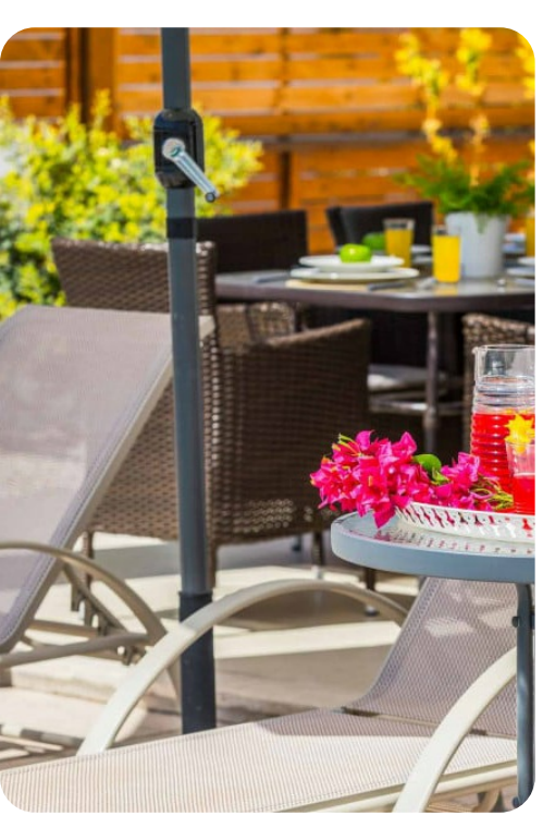
Villa White Moonflower | Page 2 of 6