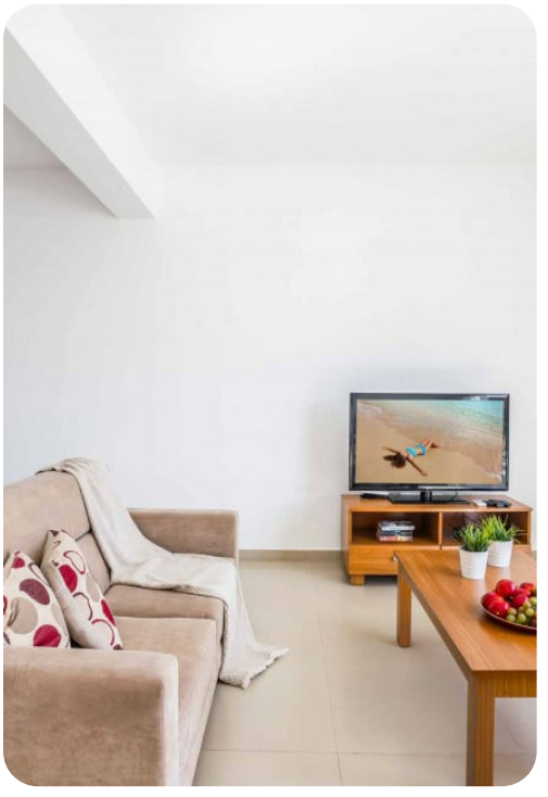
Villa White Moonflower | Page 3 of 6