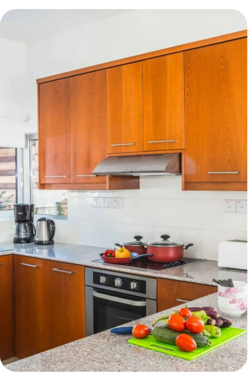
Villa White Moonflower | Page 4 of 6