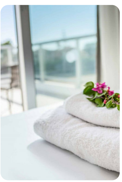
Villa White Moonflower | Page 5 of 6