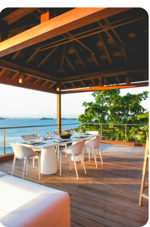
Villa What Else | Page 5 of 6