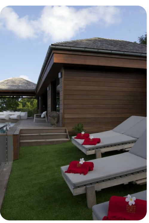
Villa What Else | Page 6 of 6