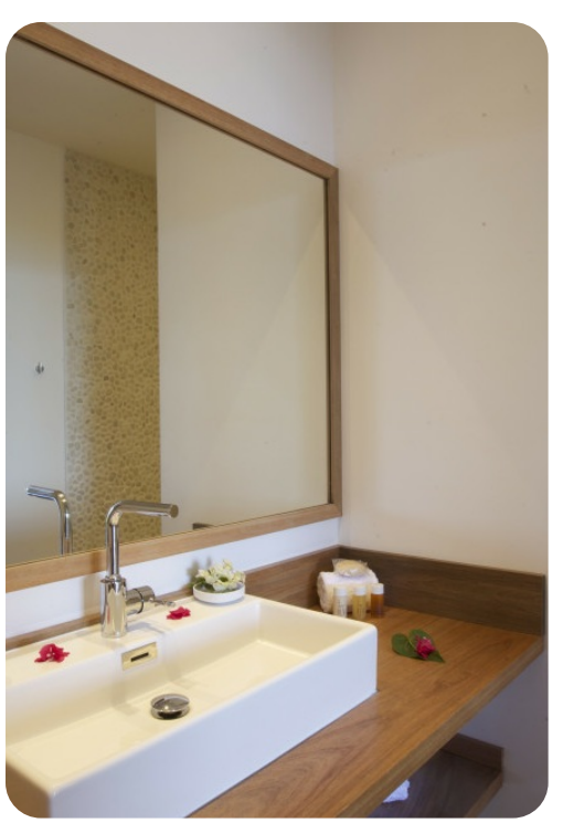
Villa What Else | Page 4 of 6