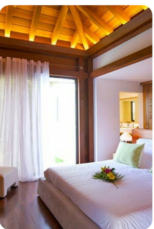
Villa What Else | Page 3 of 6