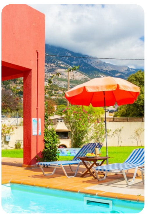
Villa Vali | Page 3 of 8