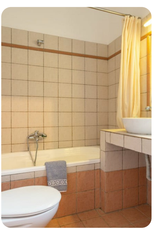
Villa Vali | Page 6 of 8