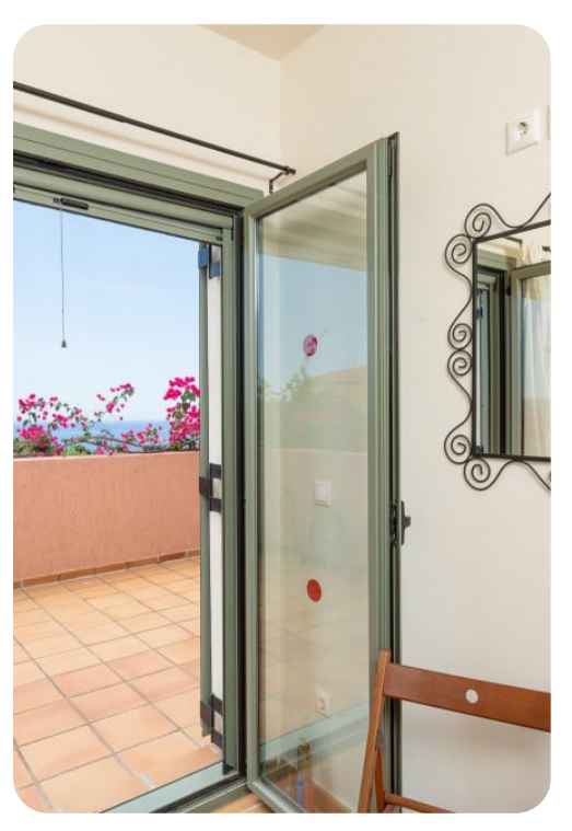
Villa Vali | Page 7 of 8