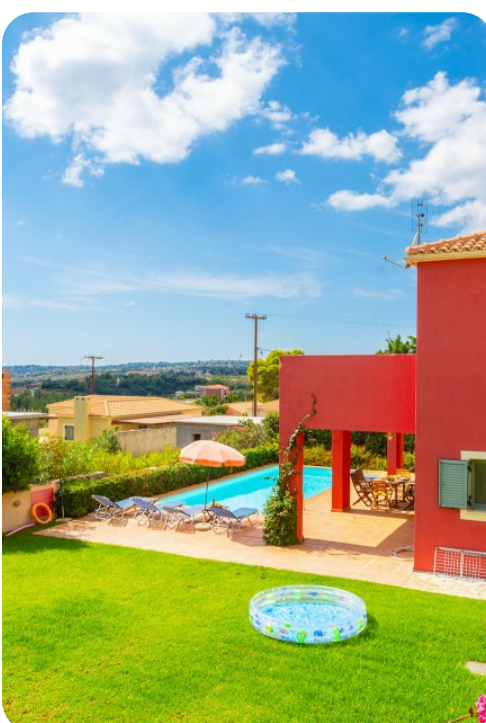
Villa Vali | Page 2 of 8