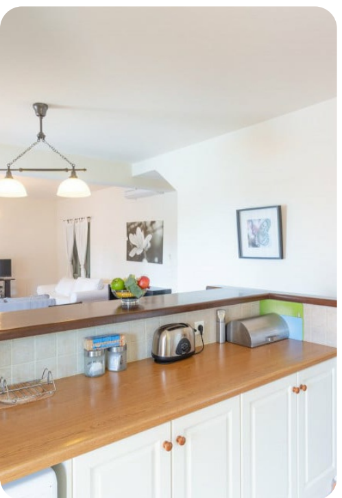
Villa Vali | Page 5 of 8