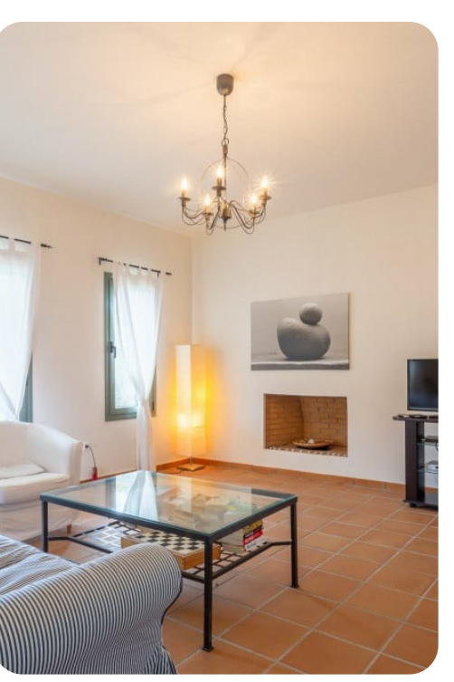
Villa Vali | Page 4 of 8