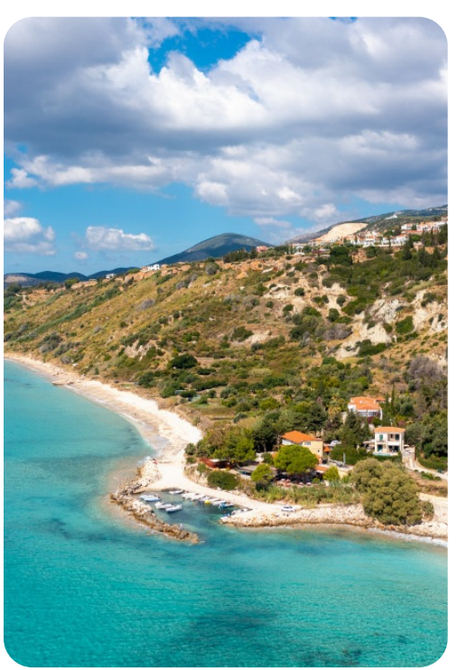
Villa Vali | Page 8 of 8