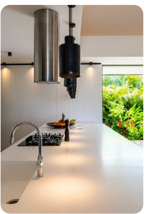
Villa Valentina | Page 4 of 8