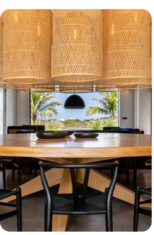
Villa Valentina | Page 3 of 8