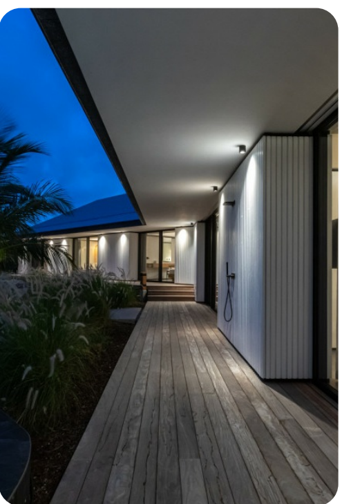
Villa Valentina | Page 8 of 8