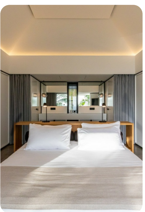
Villa Valentina | Page 6 of 8