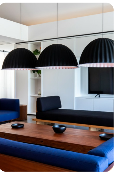
Villa Valentina | Page 2 of 8