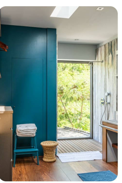
Villa Triagoz | Page 3 of 7