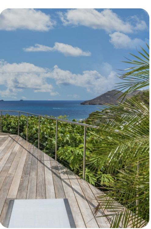
Villa Triagoz | Page 5 of 7