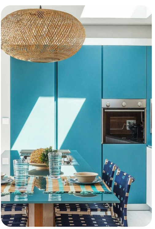
Villa Triagoz | Page 2 of 7