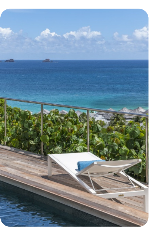
Villa Triagoz | Page 6 of 7