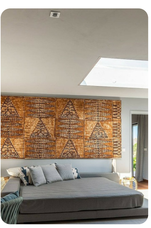
Villa Triagoz | Page 4 of 7