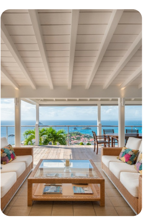
Villa Ti Moun | Page 2 of 7