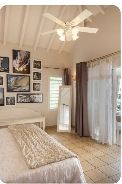
Villa Ti Moun | Page 3 of 7