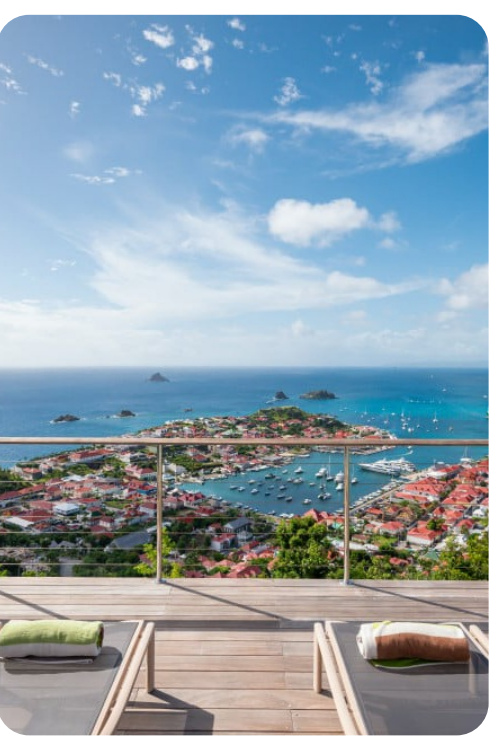
Villa Ti Moun | Page 6 of 7