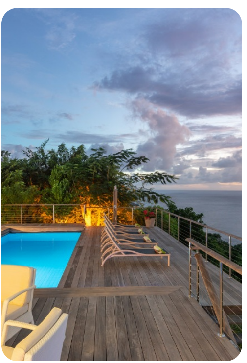
Villa Ti Moun | Page 5 of 7