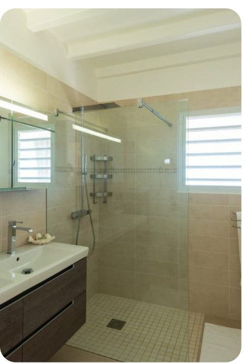
Villa Ti Moun | Page 4 of 7