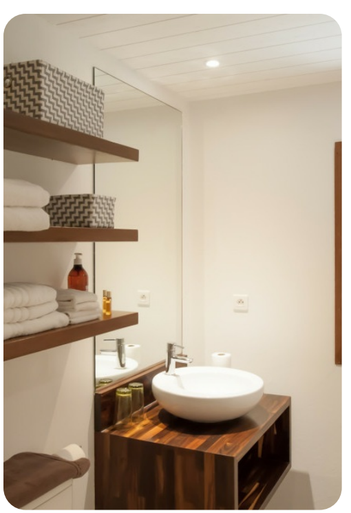
Villa Teora | Page 4 of 6