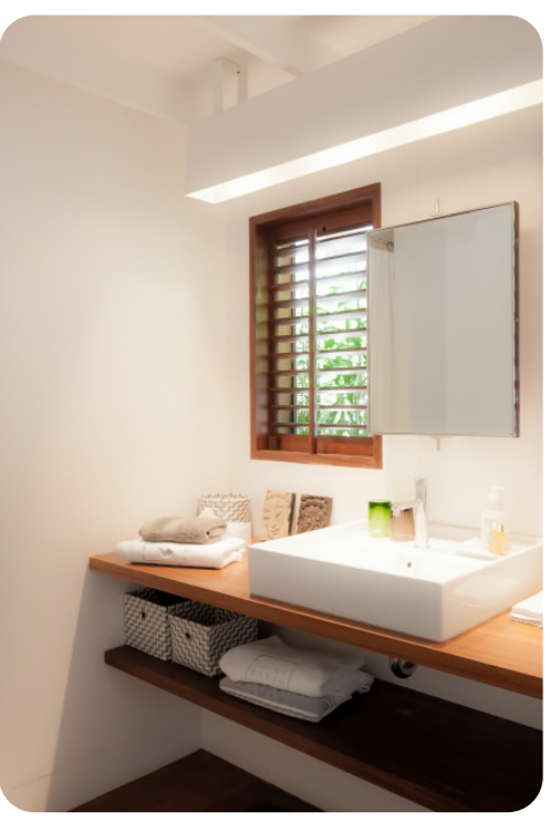
Villa Teora | Page 3 of 6