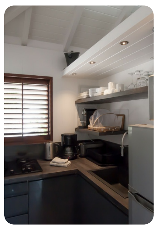
Villa Teora | Page 2 of 6