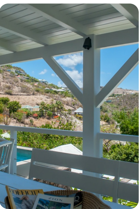
Villa Teora | Page 5 of 6