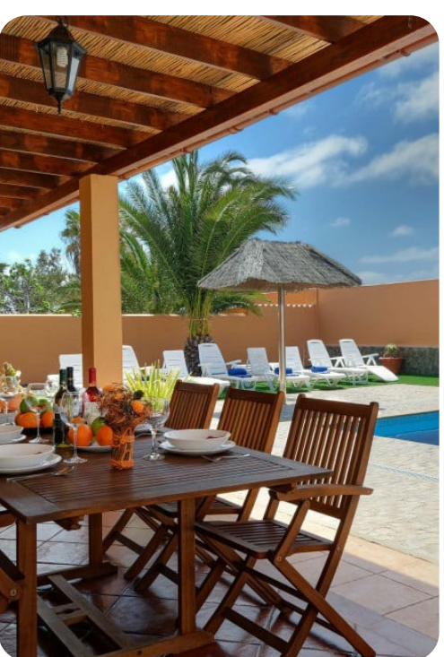
Villa Susi | Page 2 of 6