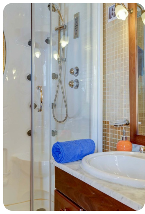
Villa Susi | Page 5 of 6