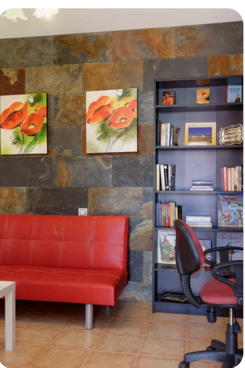
Villa Susi | Page 3 of 6