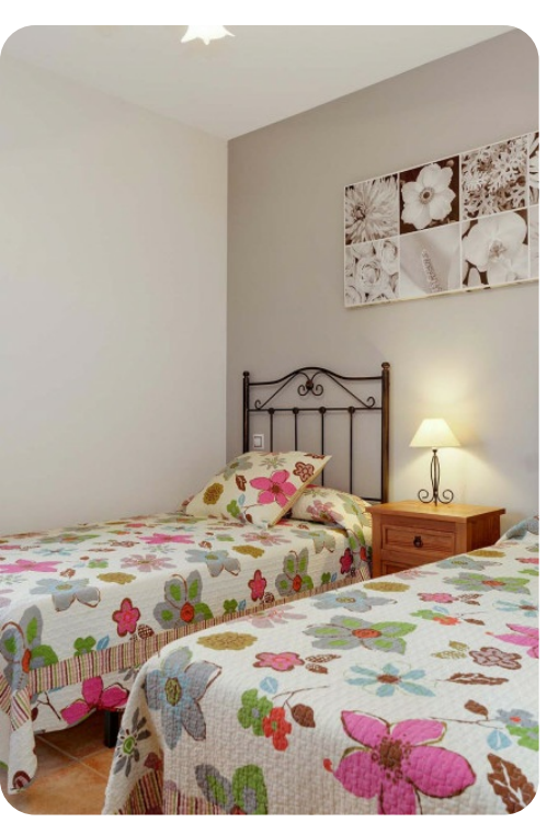
Villa Susi | Page 4 of 6