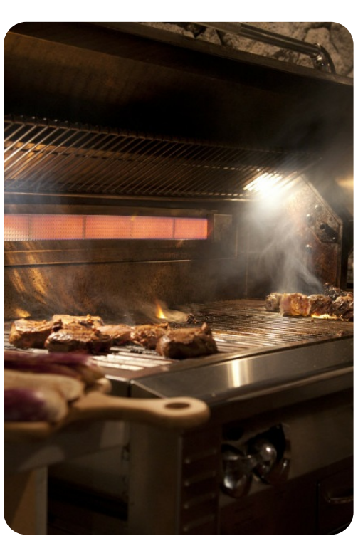
Villa Susanna | Page 6 of 8