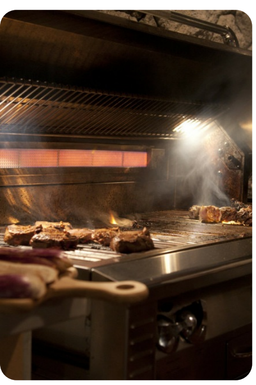
Villa Susanna | Page 2 of 8