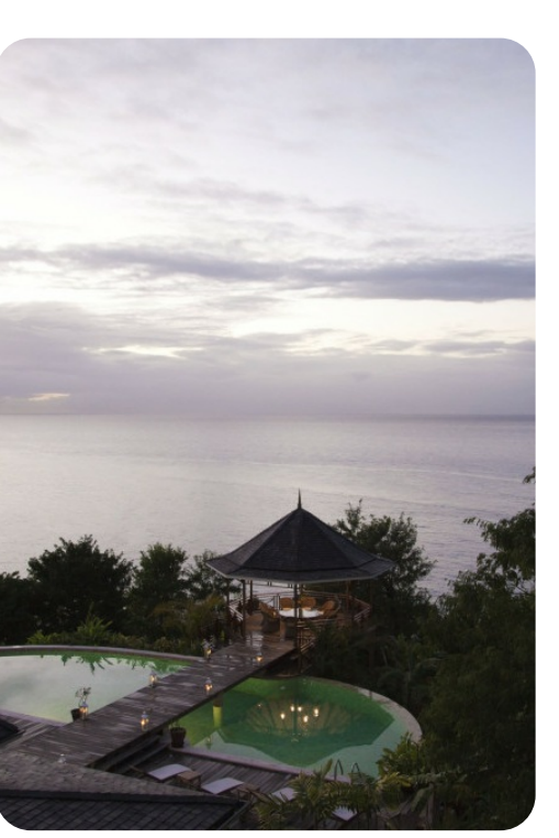
Villa Susanna | Page 8 of 8