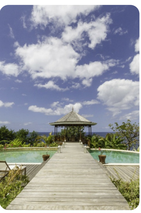
Villa Susanna | Page 7 of 8