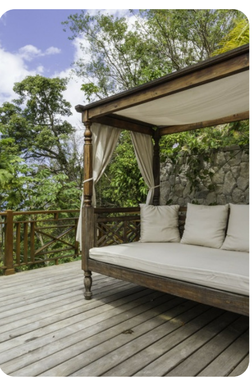
Villa Susanna | Page 4 of 8