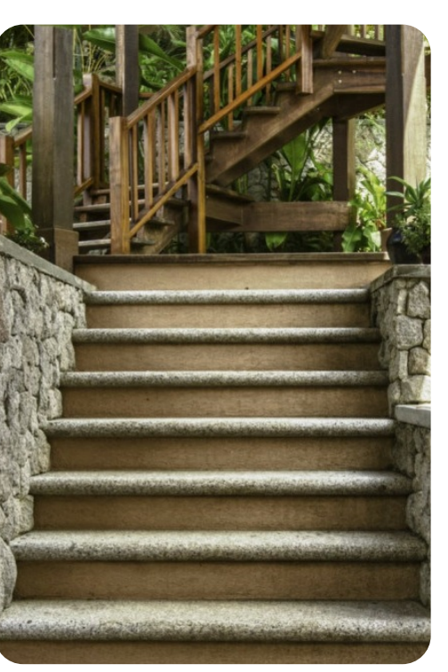
Villa Susanna | Page 3 of 8