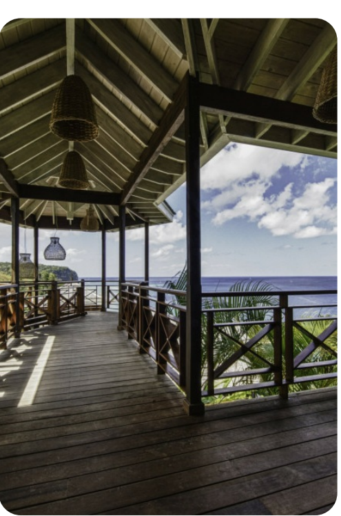
Villa Susanna | Page 5 of 8