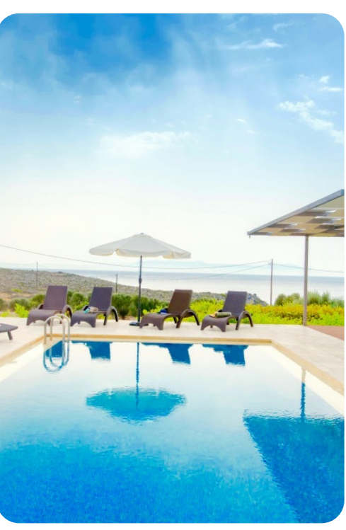
Villa Stella | Page 6 of 8