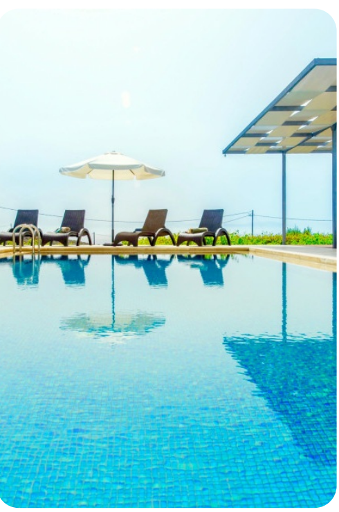
Villa Stella | Page 3 of 8