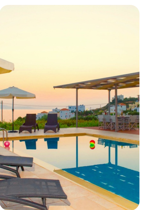
Villa Stella | Page 7 of 8