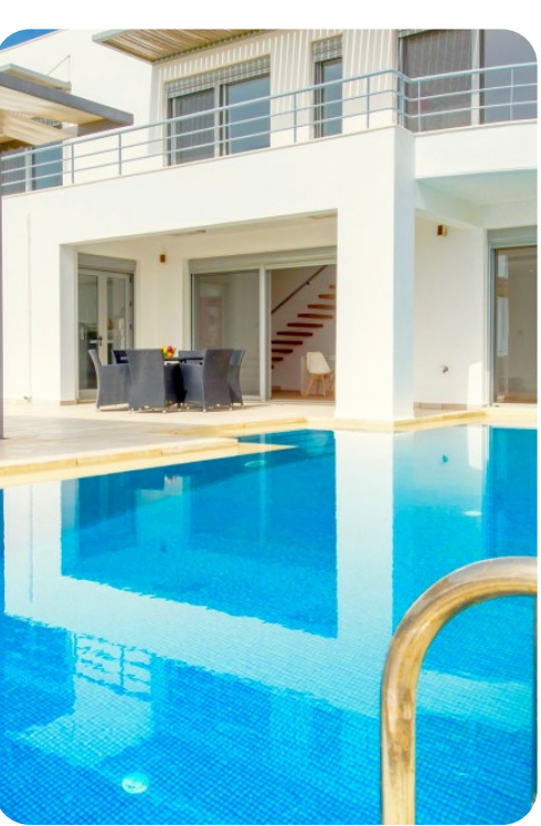
Villa Stella | Page 5 of 8