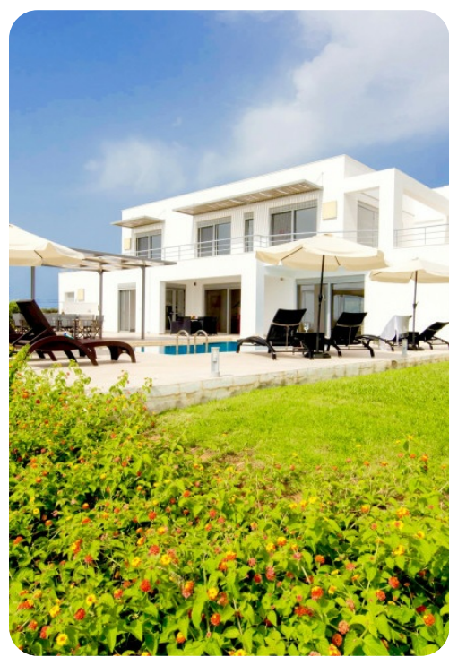
Villa Stella | Page 2 of 8