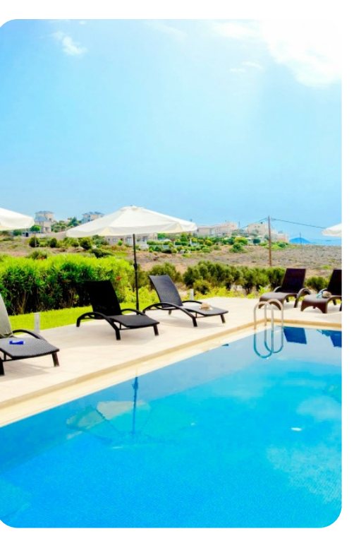
Villa Stella | Page 4 of 8