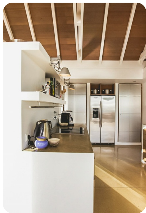
Villa Seaweed | Page 2 of 7