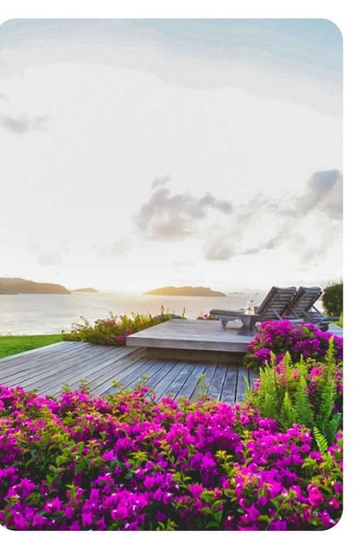
Villa Seaweed | Page 6 of 7