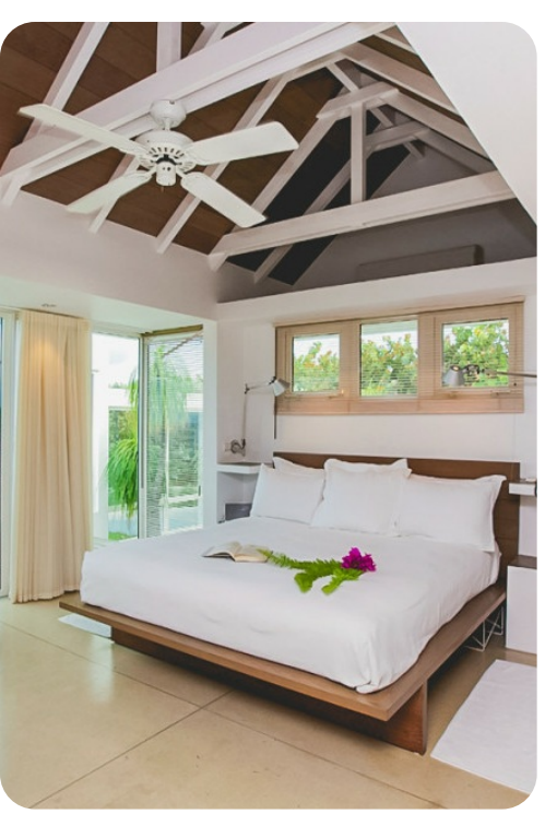
Villa Seaweed | Page 4 of 7