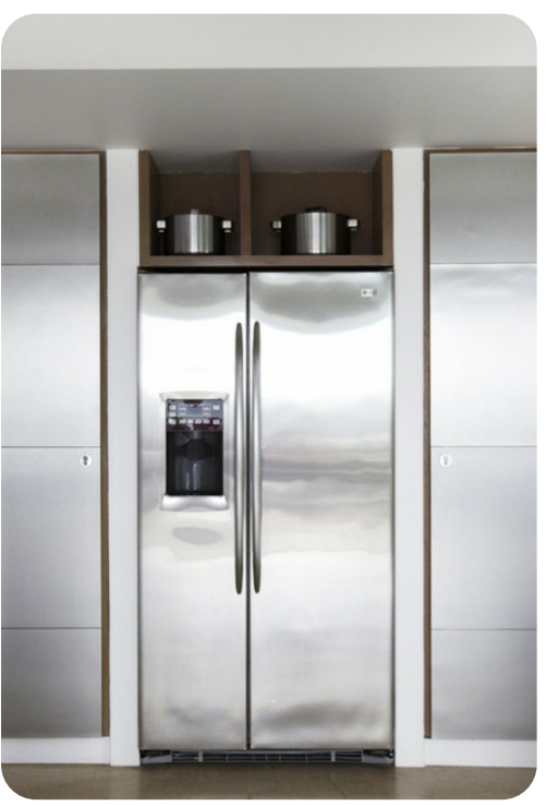
Villa Seaweed | Page 3 of 7