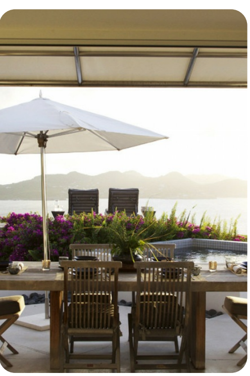
Villa Seaweed | Page 5 of 7