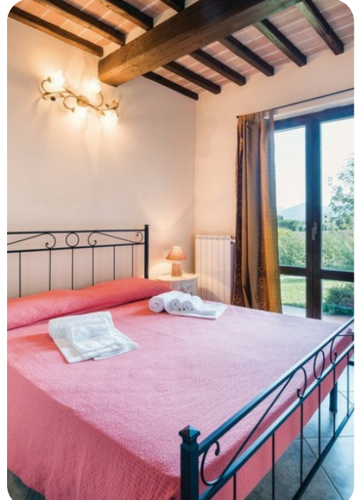
Villa San Lorenzo | Page 3 of 8