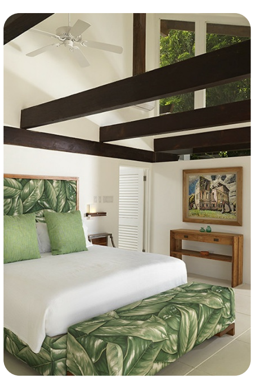
Villa Rosa | Page 4 of 5