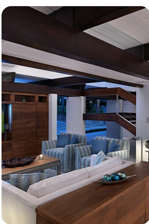
Villa Rosa | Page 2 of 5