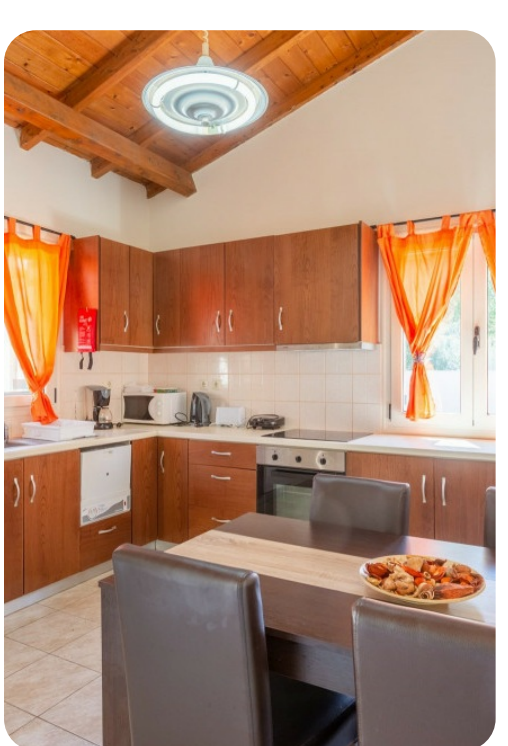
Villa Popi | Page 2 of 8