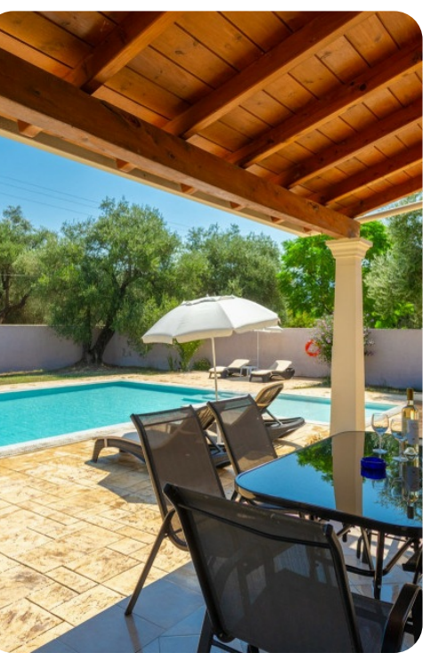
Villa Popi | Page 5 of 8