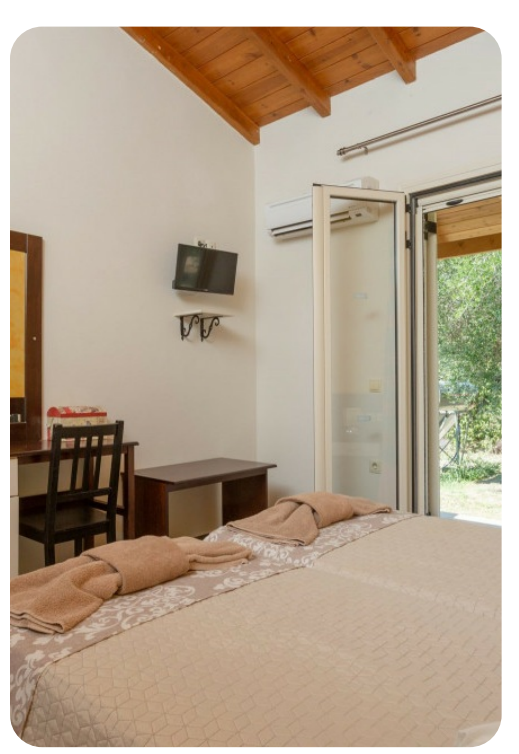
Villa Popi | Page 3 of 8