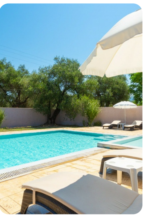
Villa Popi | Page 6 of 8