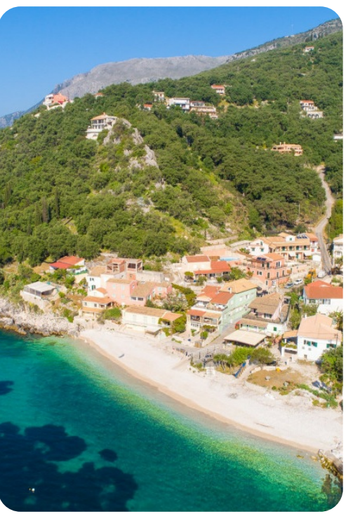
Villa Popi | Page 7 of 8