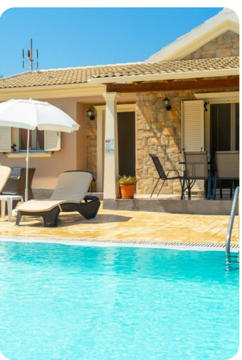
Villa Popi | Page 4 of 8