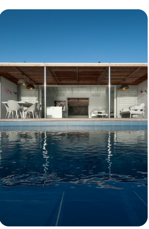
Villa Pointe Milou | Page 6 of 7