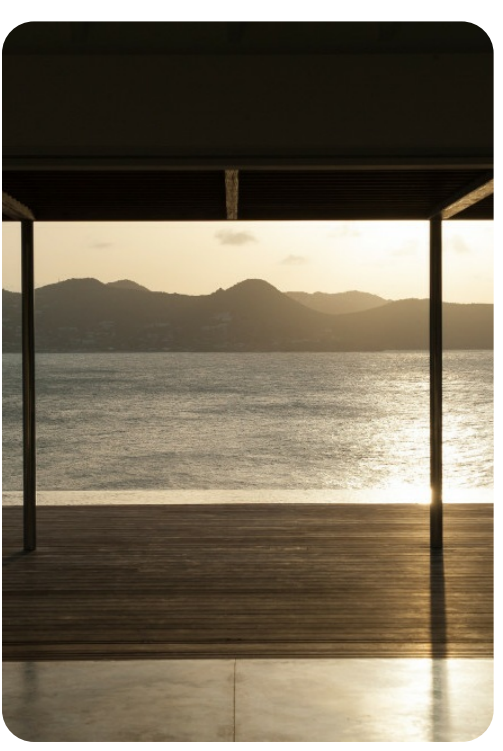
Villa Pointe Milou | Page 5 of 7