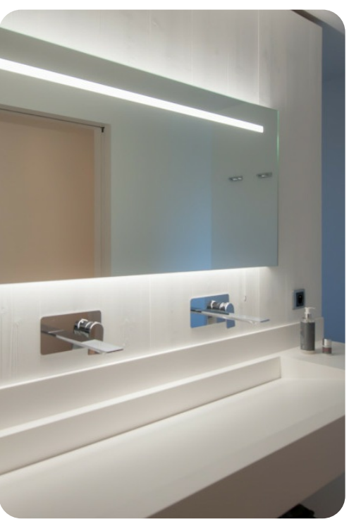
Villa Pointe Milou | Page 3 of 7