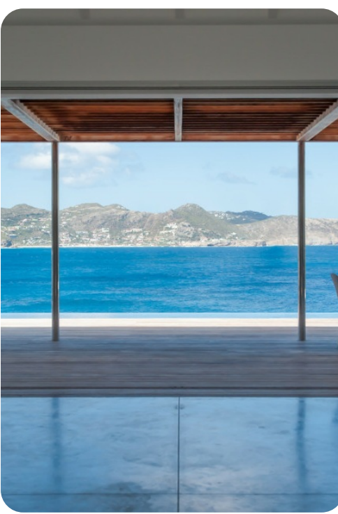
Villa Pointe Milou | Page 2 of 7