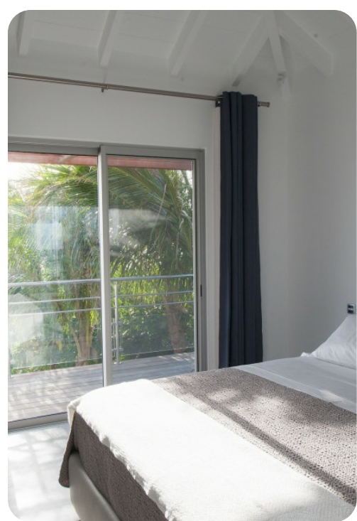
Villa Pointe Milou | Page 4 of 7