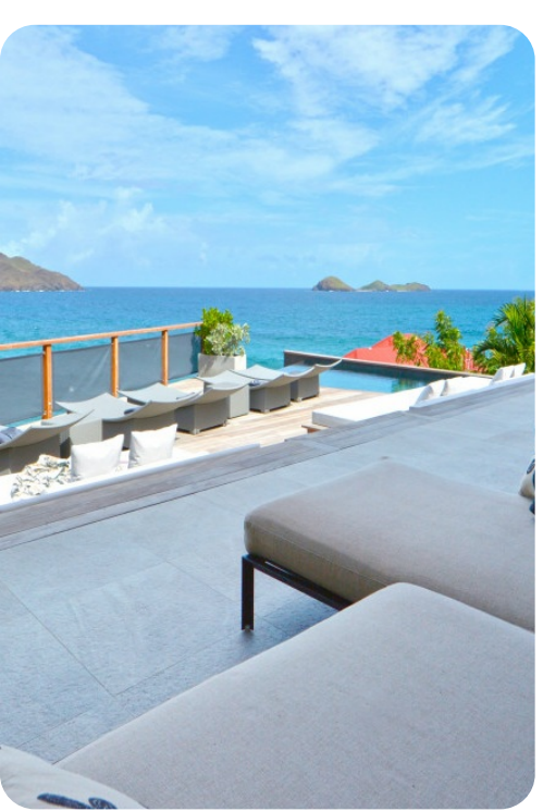
Villa Pelican | Page 6 of 6