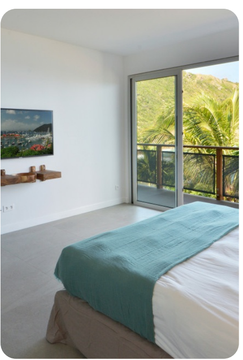
Villa Pelican | Page 4 of 6