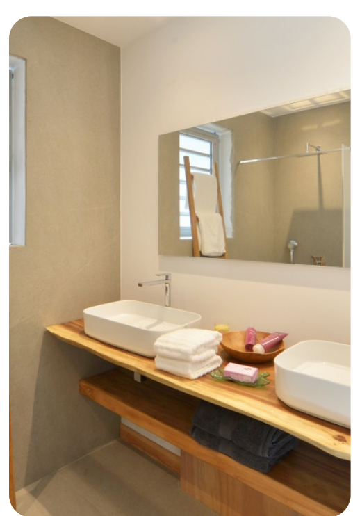
Villa Pelican | Page 5 of 6