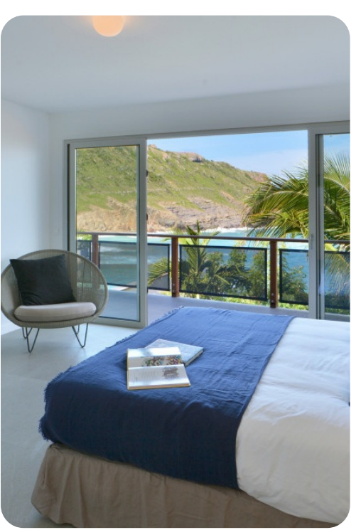
Villa Pelican | Page 3 of 6