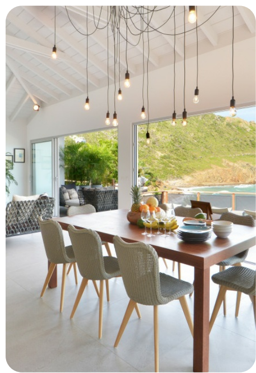
Villa Pelican | Page 2 of 6