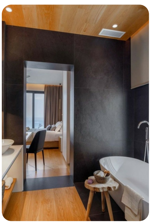
Villa Peach | Page 5 of 6