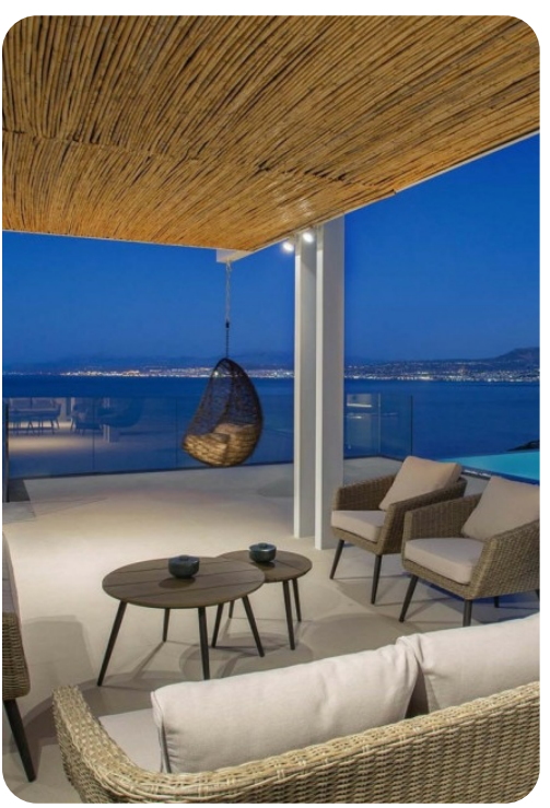
Villa Peach | Page 2 of 6