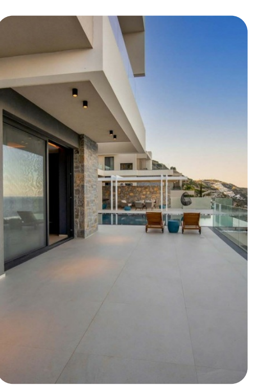
Villa Peach | Page 3 of 6