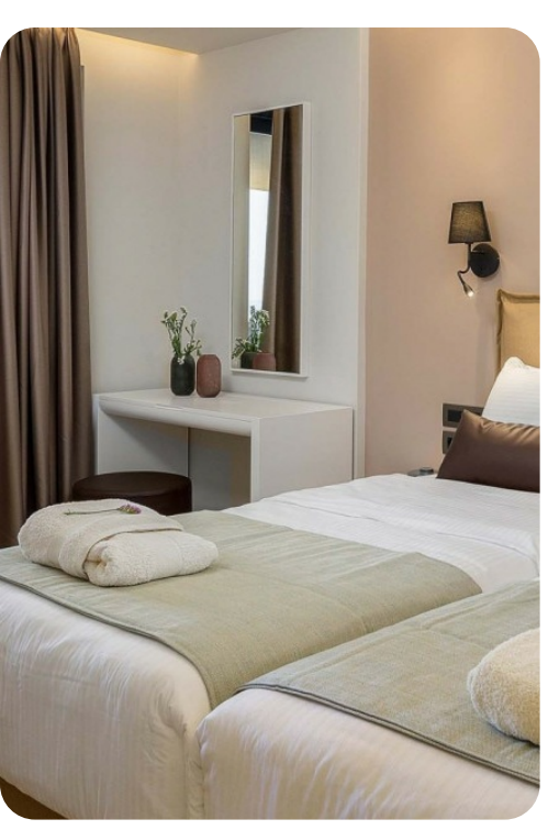
Villa Peach | Page 4 of 6