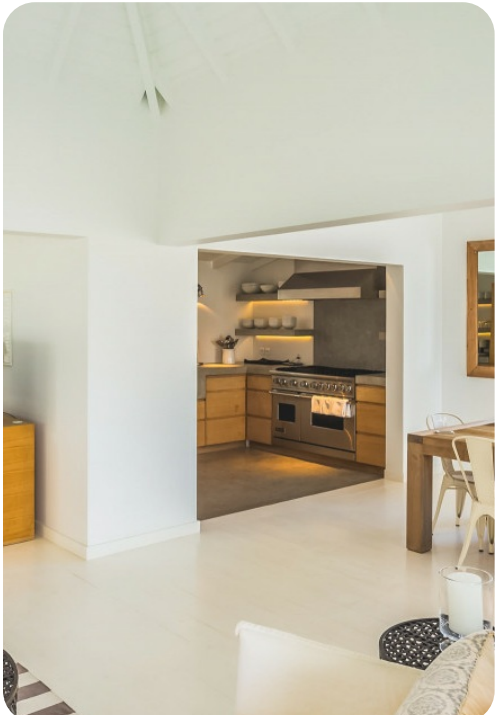
Villa Pastels | Page 2 of 8