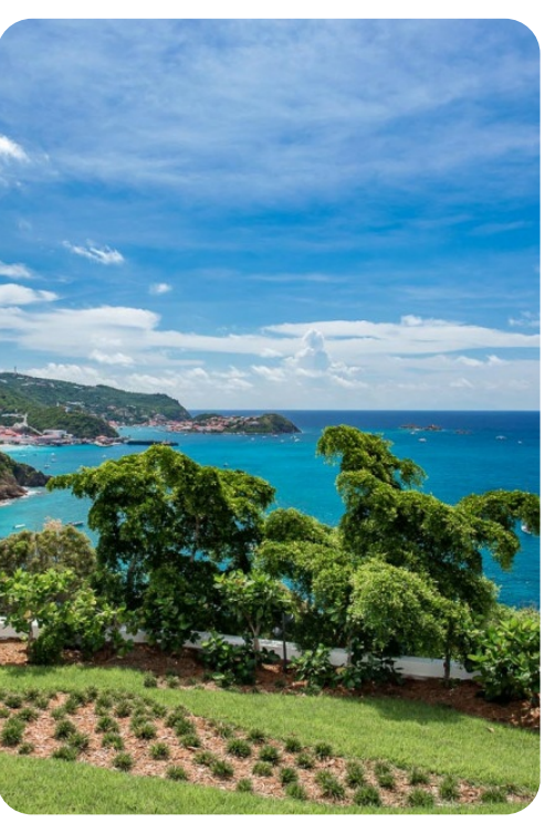
Villa Passage | Page 6 of 7