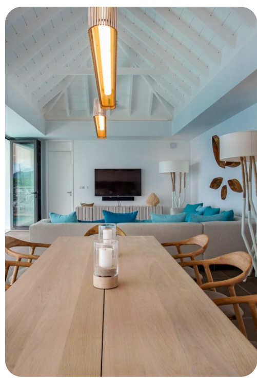
Villa Passage | Page 2 of 7