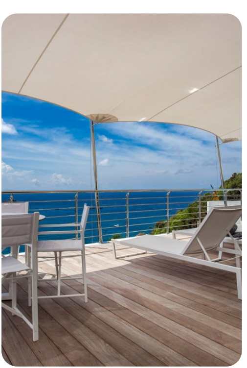
Villa Passage | Page 5 of 7