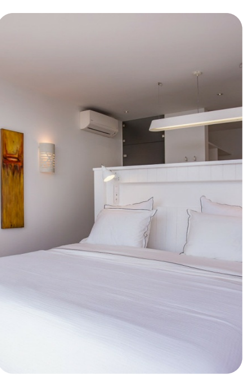
Villa Passage | Page 4 of 7