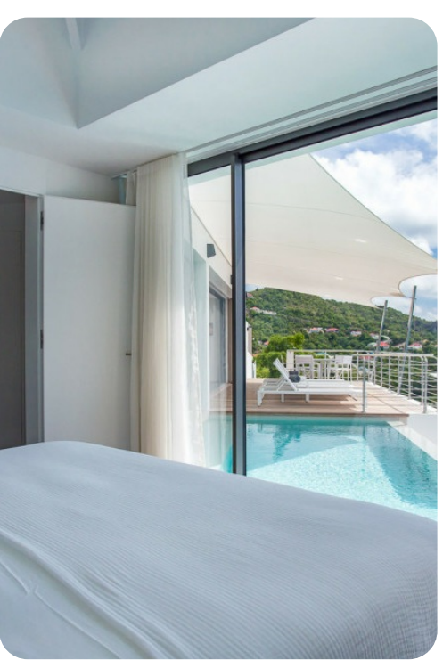
Villa Passage | Page 3 of 7