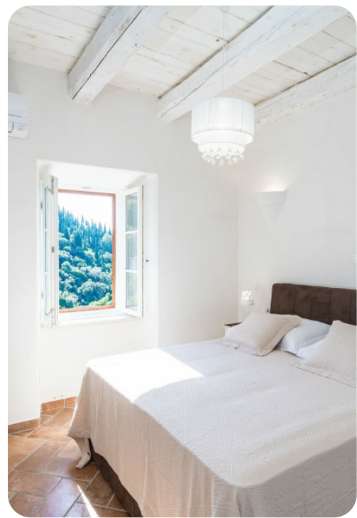
Villa Palma | Page 3 of 8