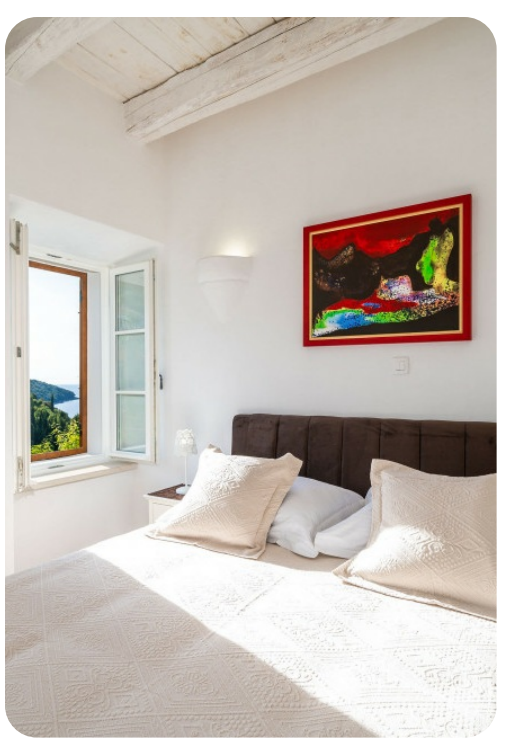
Villa Palma | Page 4 of 8