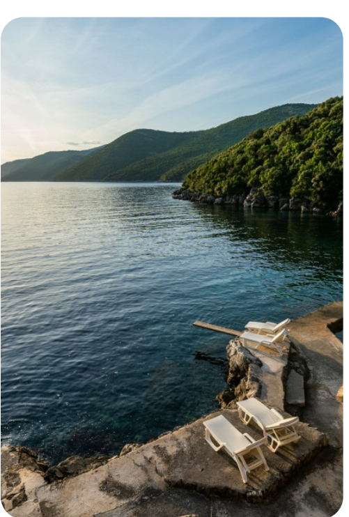
Villa Palma | Page 8 of 8