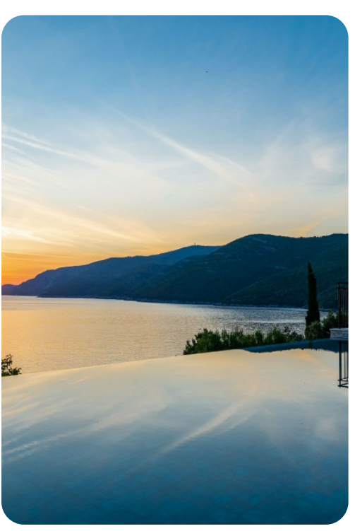
Villa Palma | Page 5 of 8