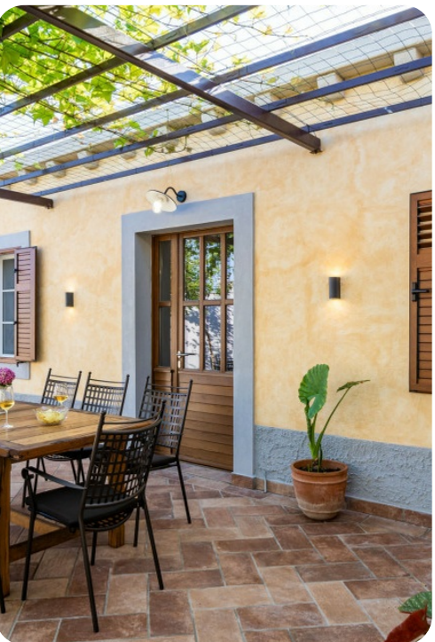
Villa Palma | Page 6 of 8