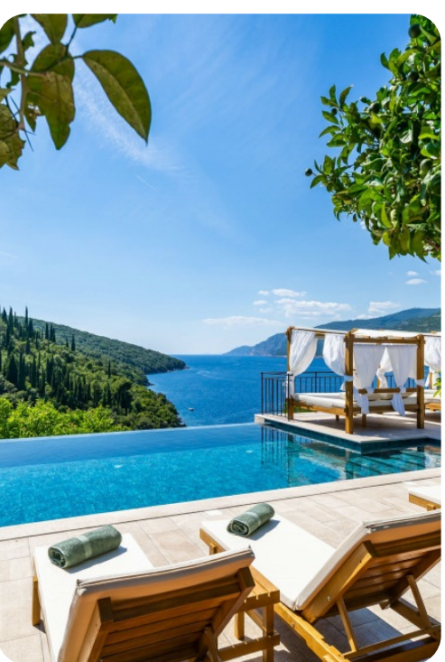
Villa Palma | Page 7 of 8