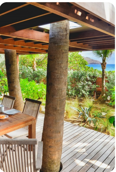
Villa Palm House | Page 2 of 5