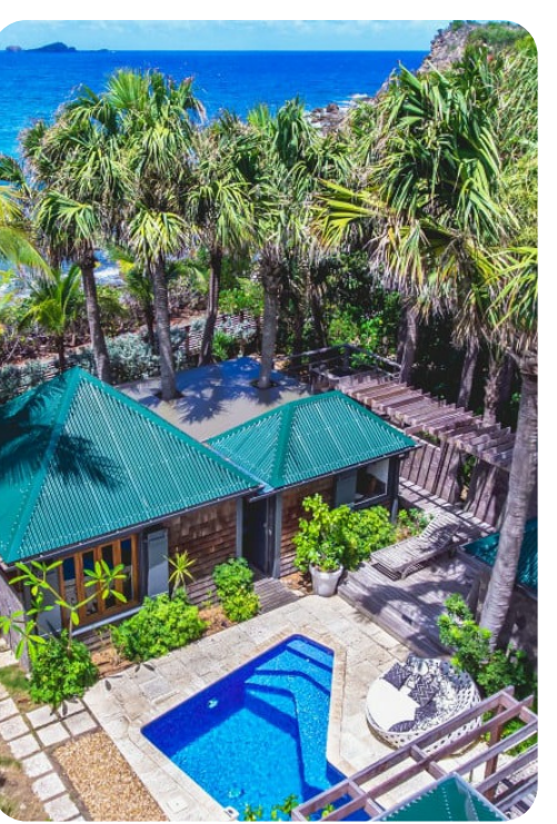
Villa Palm House | Page 4 of 5