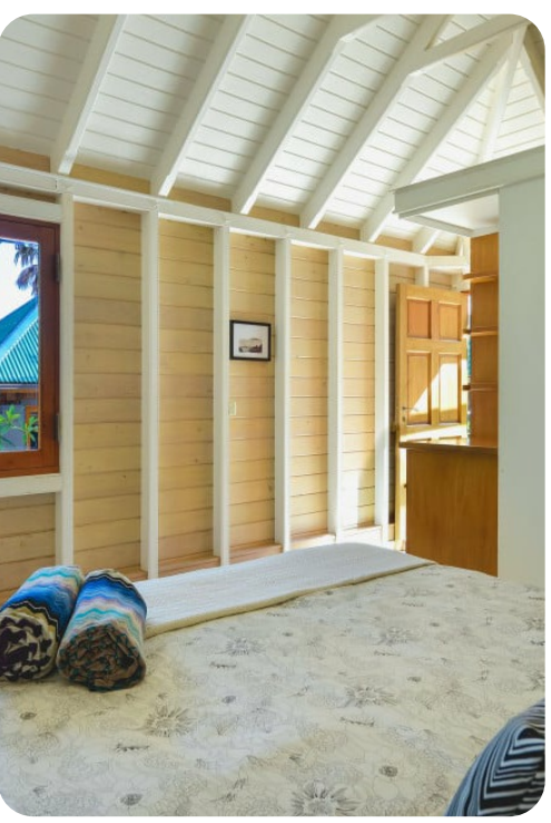
Villa Palm House | Page 3 of 5