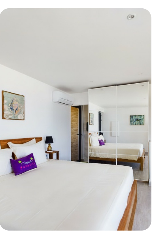
Villa On the Rock | Page 3 of 6