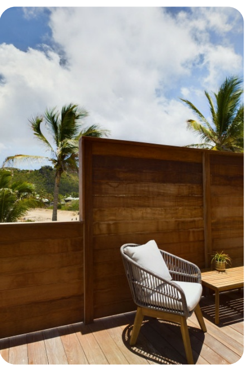
Villa On the Rock | Page 5 of 6