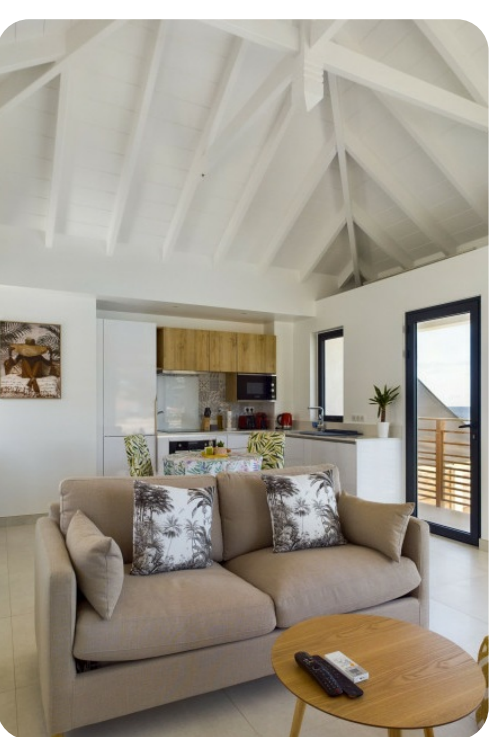
Villa On the Rock | Page 2 of 6