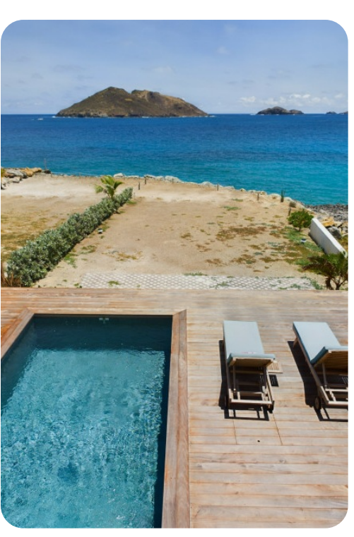
Villa On the Rock | Page 4 of 6