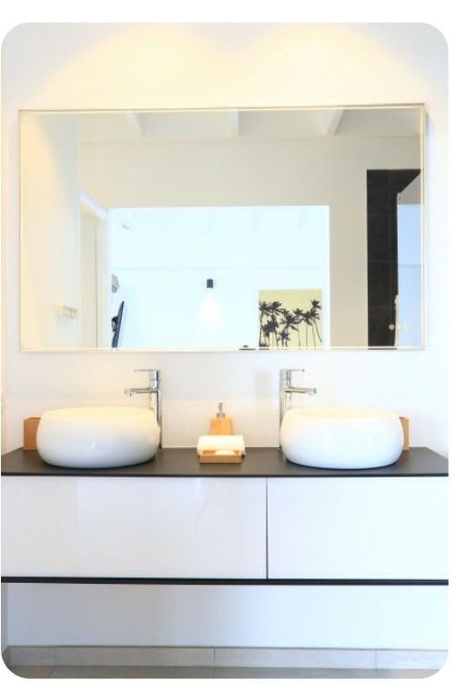
Villa North Waves | Page 3 of 6