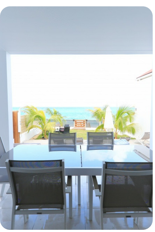
Villa North Waves | Page 5 of 6