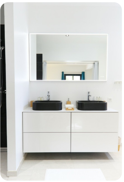
Villa North Waves | Page 4 of 6