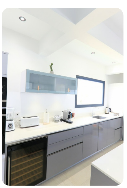
Villa North Waves | Page 2 of 6