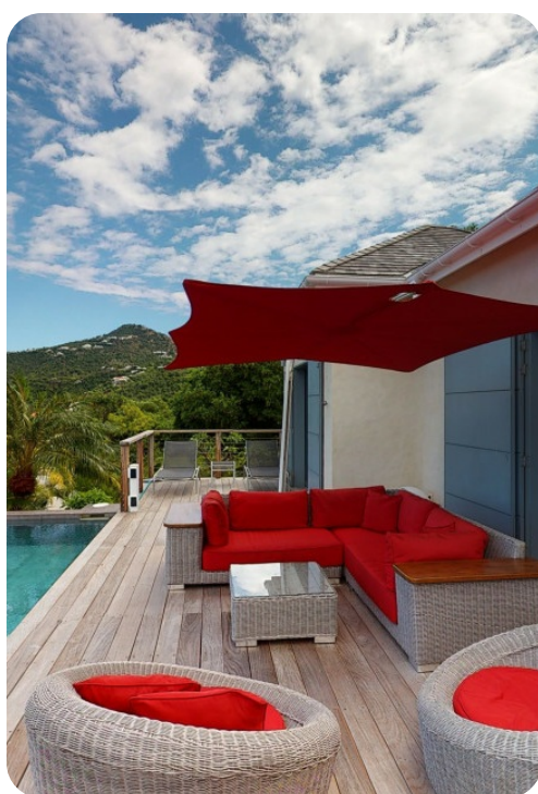
Villa Nita | Page 4 of 6