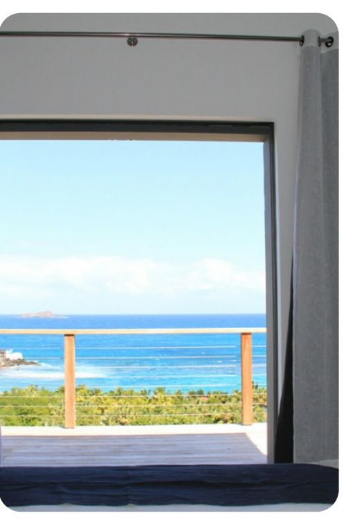
Villa Nita | Page 3 of 6