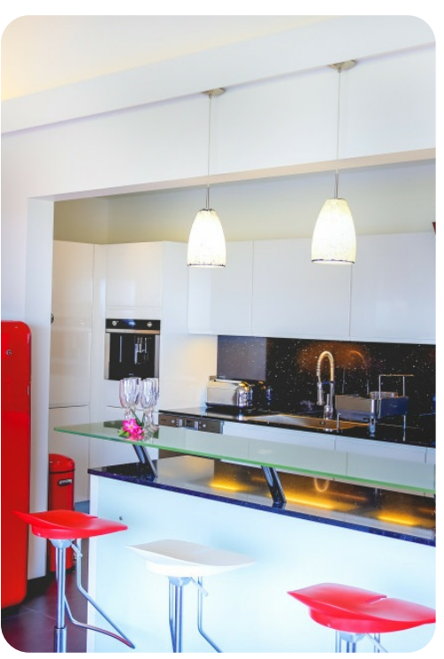
Villa Nita | Page 2 of 6