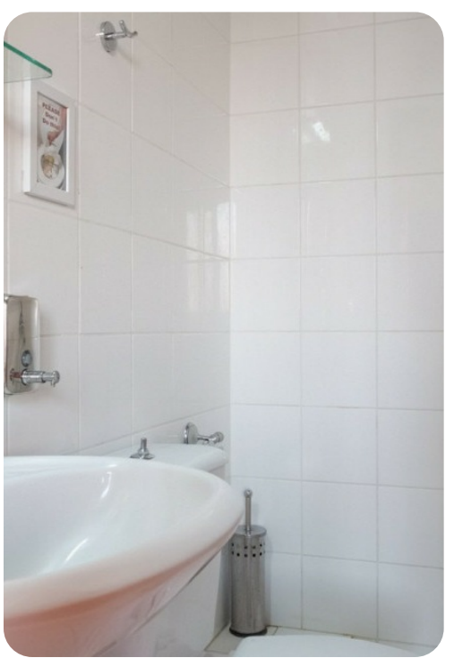
Villa Nineta | Page 5 of 8