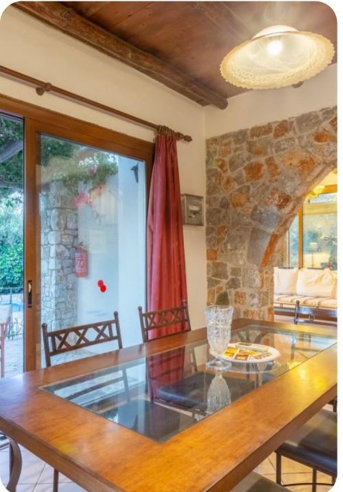
Villa Nineta | Page 3 of 8