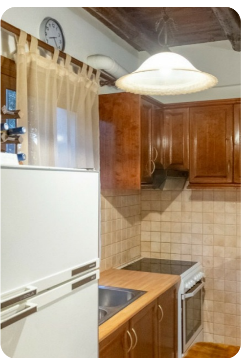
Villa Nineta | Page 4 of 8