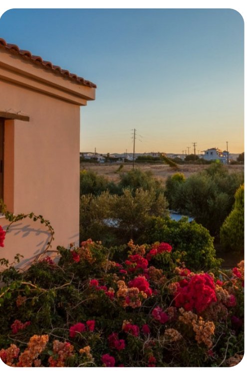
Villa Nineta | Page 6 of 8