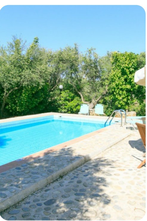
Villa Nineta | Page 8 of 8