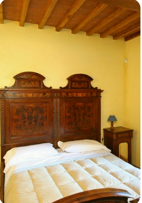
Villa Monnalisa | Page 5 of 8