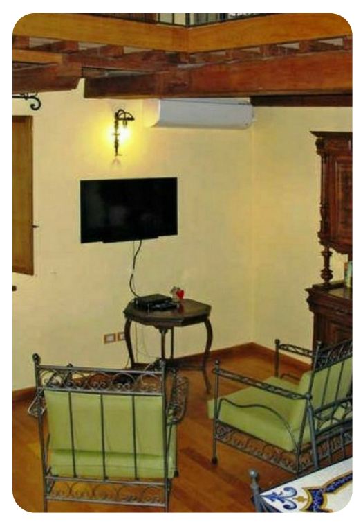
Villa Monnalisa | Page 4 of 8