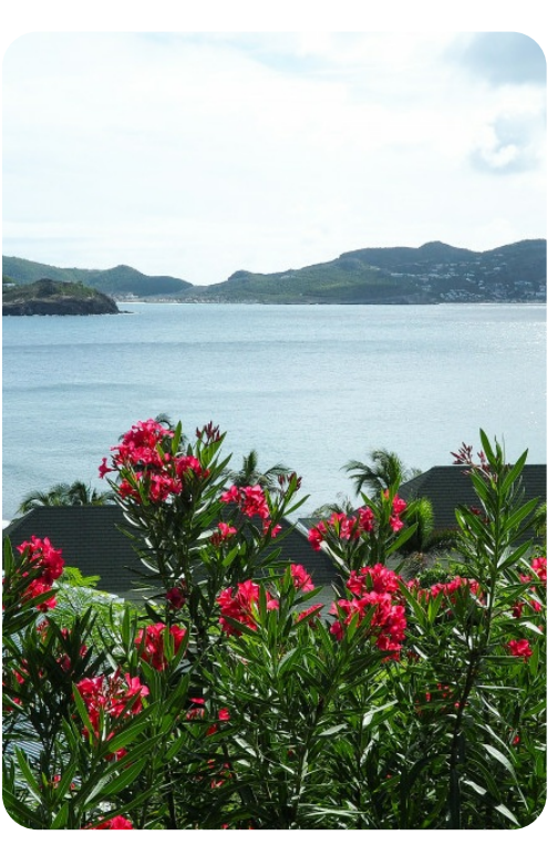
Villa Mirande | Page 8 of 8