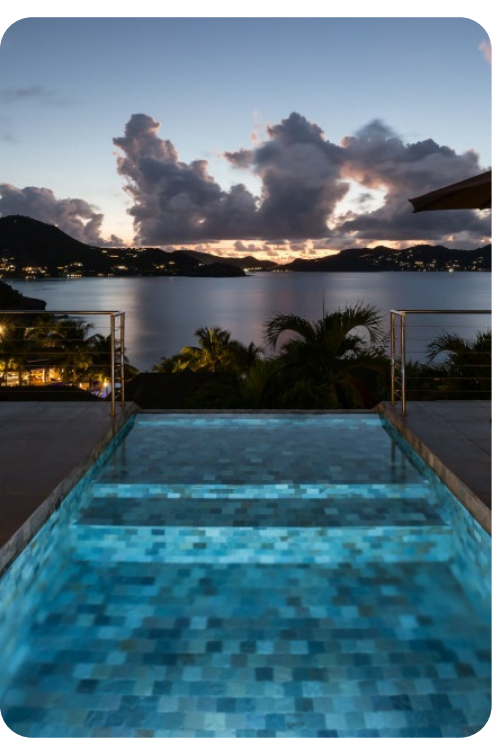
Villa Mirande | Page 7 of 8