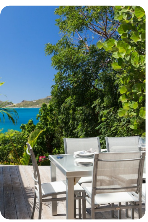
Villa Mirande | Page 6 of 8