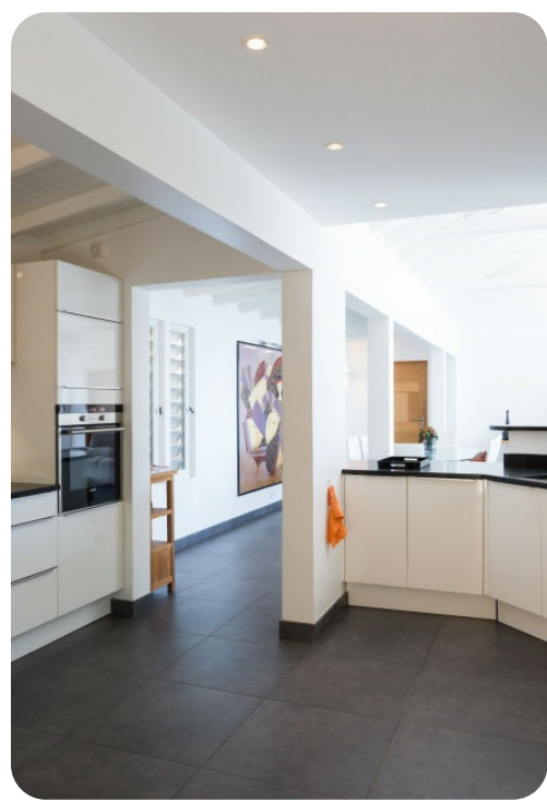
Villa Mirande | Page 2 of 8