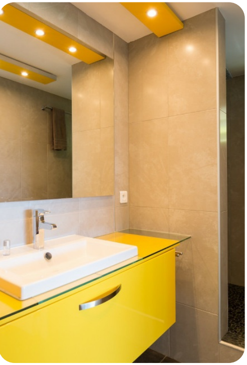
Villa Mirande | Page 5 of 8