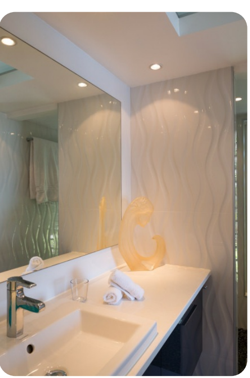
Villa Mirande | Page 3 of 8