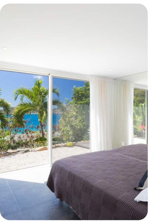
Villa Mirande | Page 4 of 8