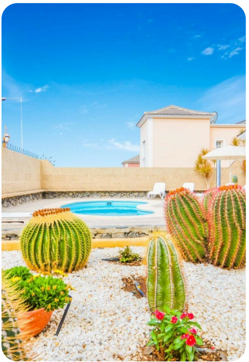
Villa Miranda | Page 2 of 6