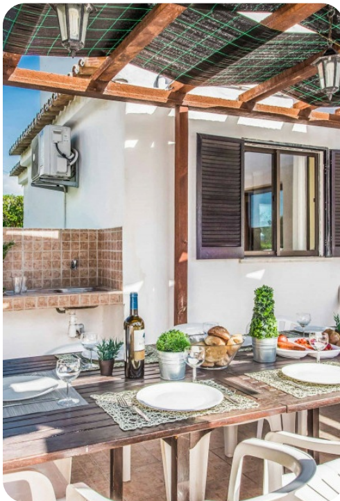
Villa Miramar Algarve | Page 3 of 8