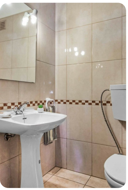
Villa Miramar Algarve | Page 8 of 8