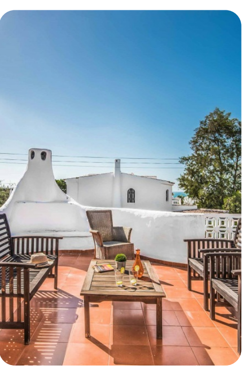
Villa Miramar Algarve | Page 5 of 8