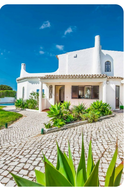
Villa Miramar Algarve | Page 4 of 8