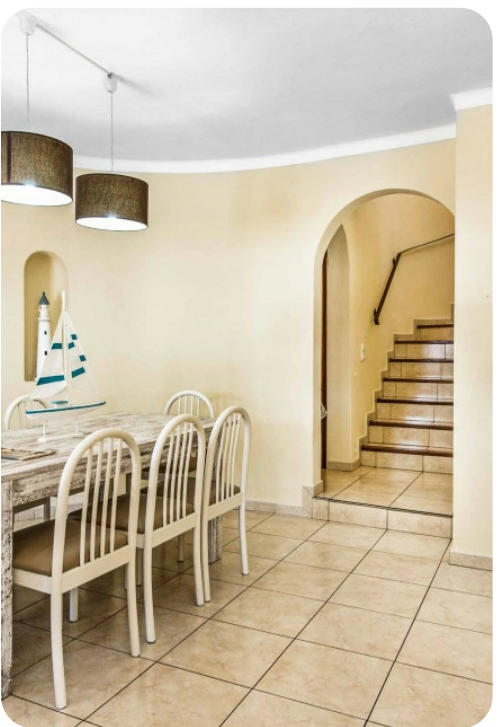
Villa Miramar Algarve | Page 6 of 8