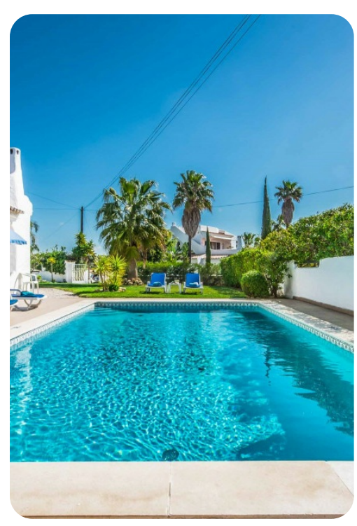
Villa Miramar Algarve | Page 2 of 8