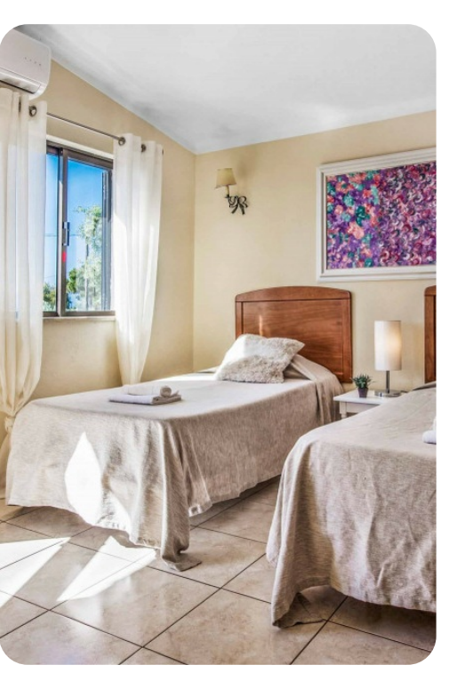
Villa Miramar Algarve | Page 7 of 8