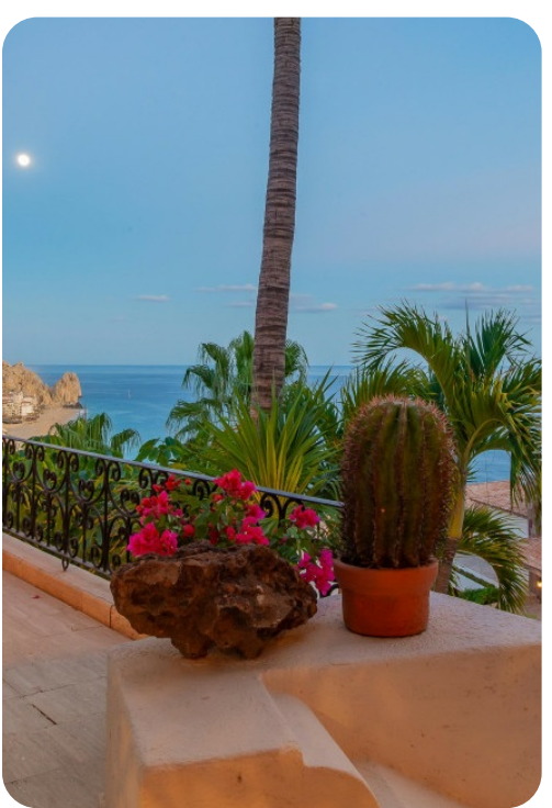
Villa Miramar | Page 8 of 8