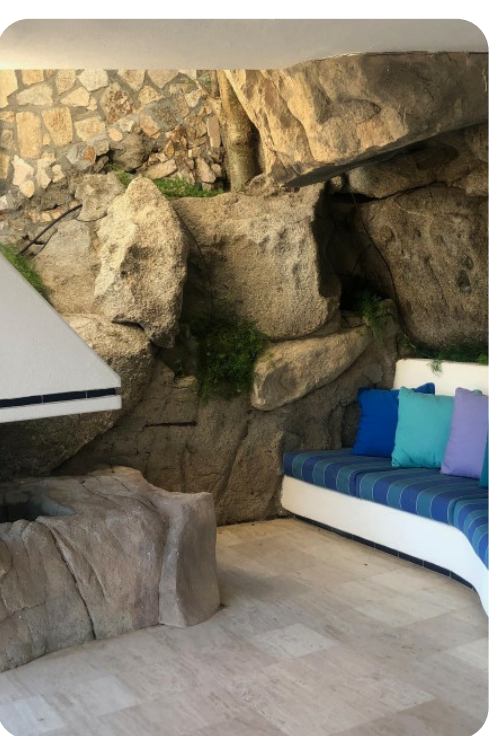
Villa Miramar | Page 6 of 8