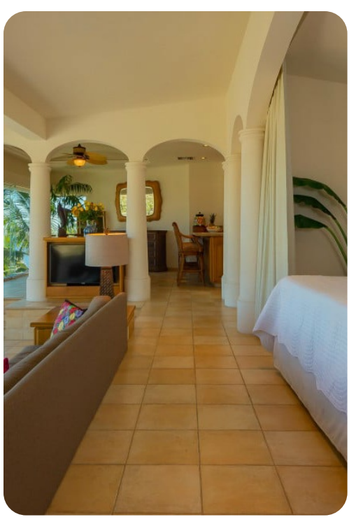
Villa Miramar | Page 4 of 8