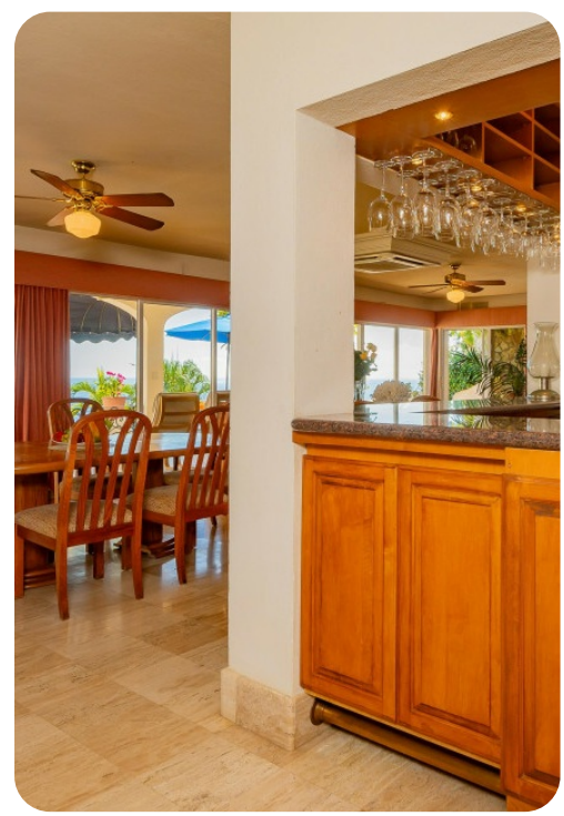
Villa Miramar | Page 3 of 8