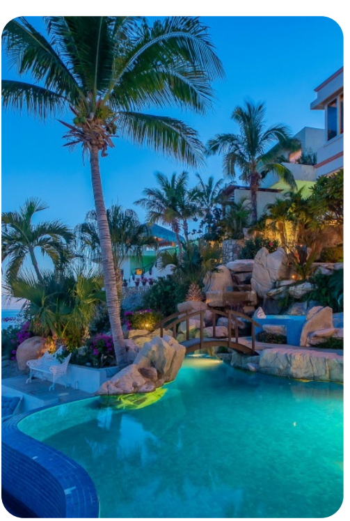
Villa Miramar | Page 7 of 8