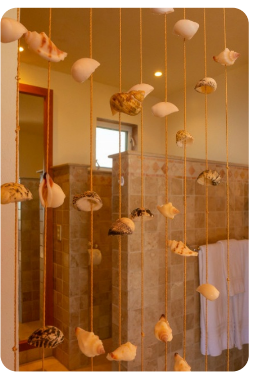
Villa Miramar | Page 5 of 8