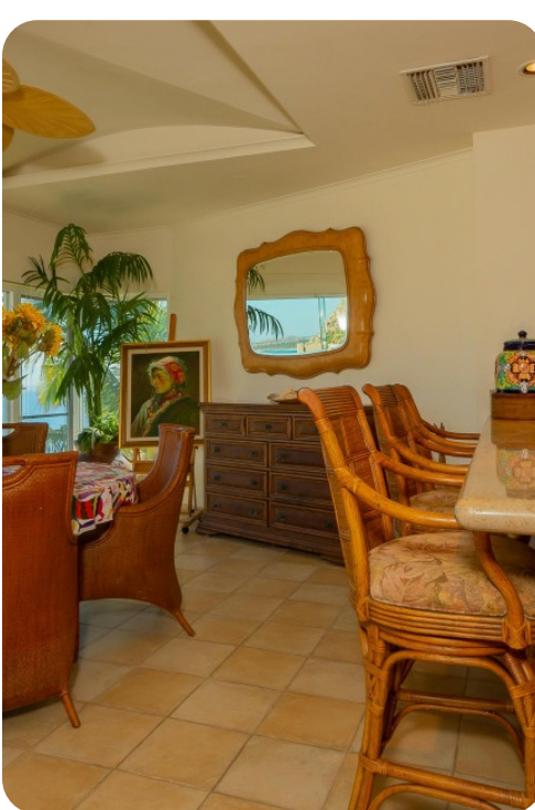
Villa Miramar | Page 2 of 8