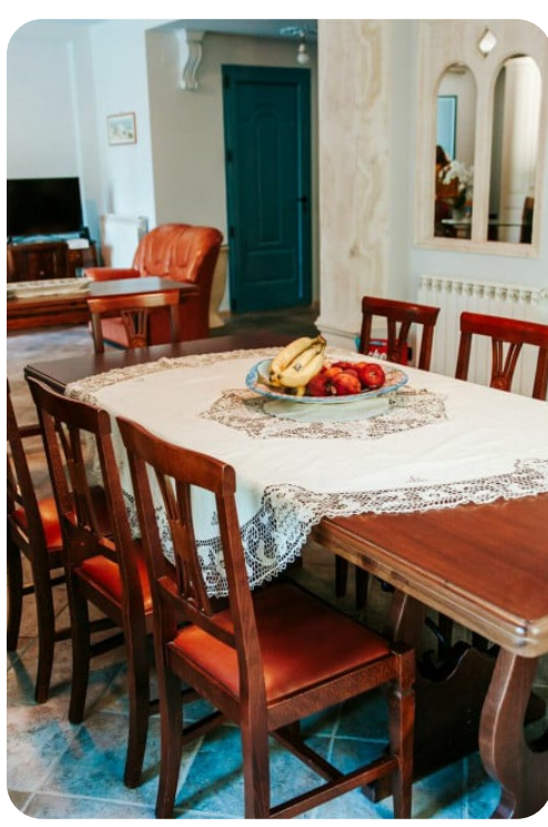
Villa Millefiori | Page 2 of 8