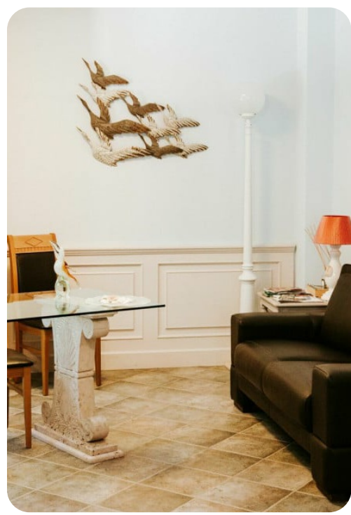
Villa Millefiori | Page 3 of 8