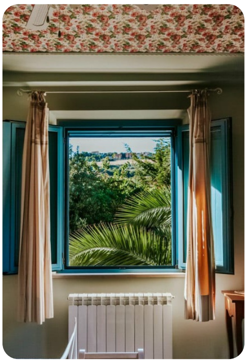
Villa Millefiori | Page 8 of 8