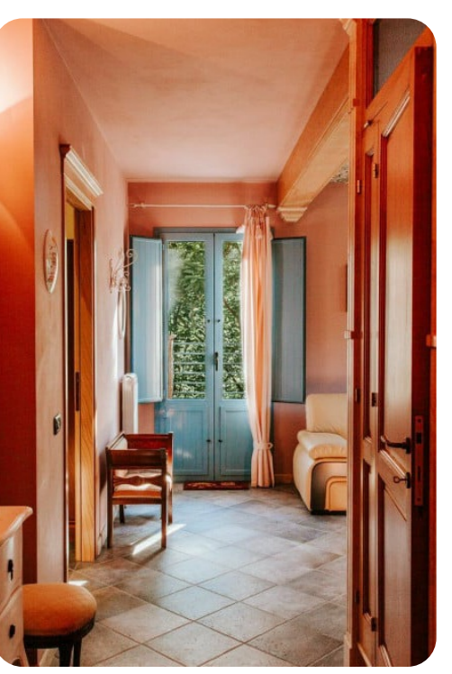
Villa Millefiori | Page 5 of 8