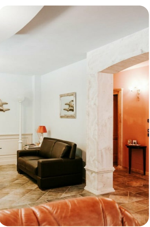
Villa Millefiori | Page 4 of 8