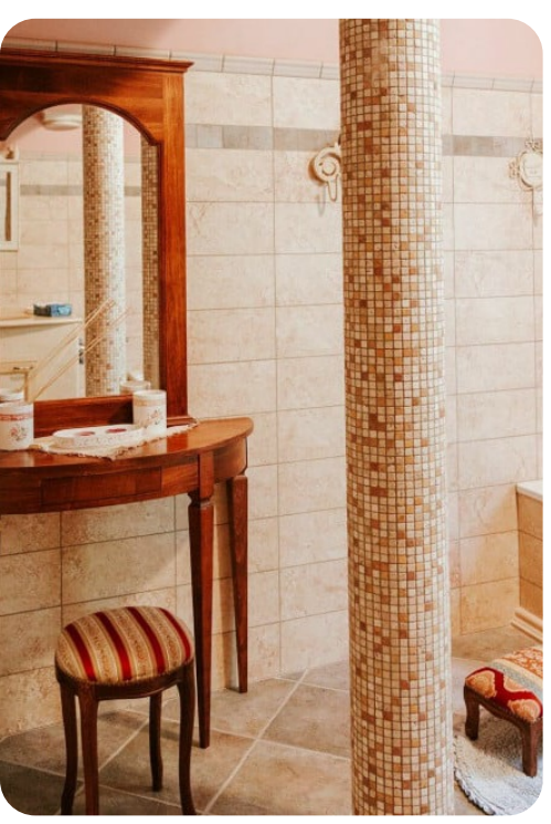
Villa Millefiori | Page 6 of 8