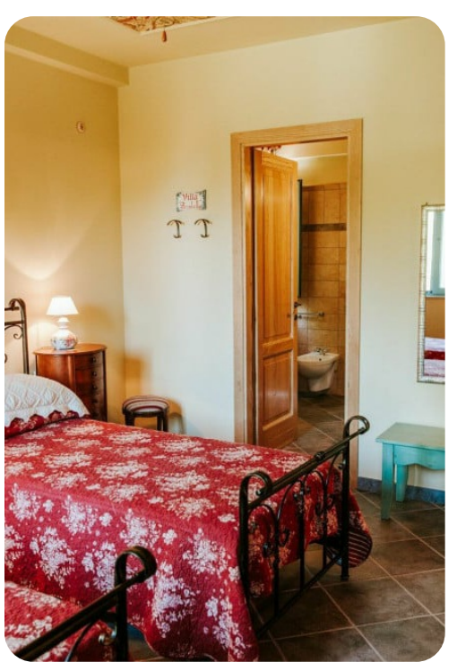
Villa Millefiori | Page 7 of 8