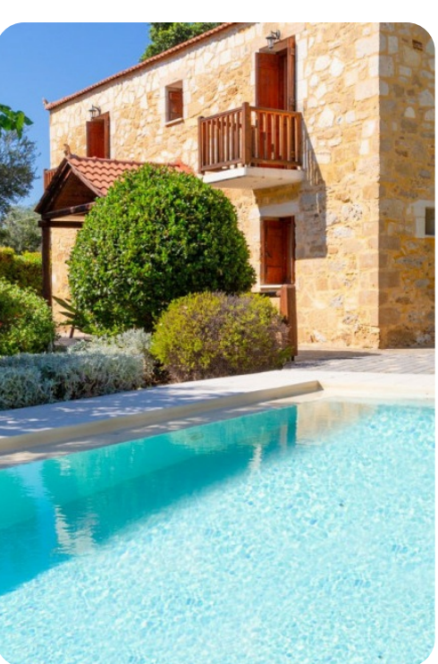
Villa Miguela | Page 4 of 8