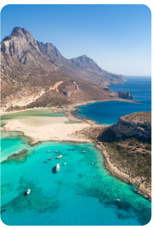
Villa Miguela | Page 8 of 8