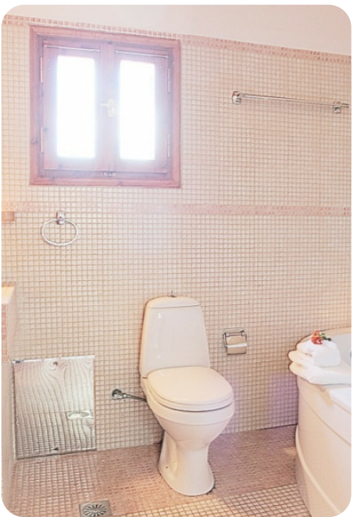
Villa Miguela | Page 3 of 8