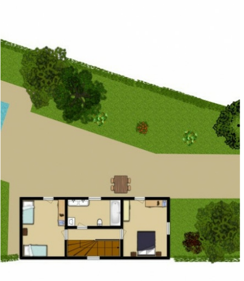
Villa Miguela | Page 7 of 8