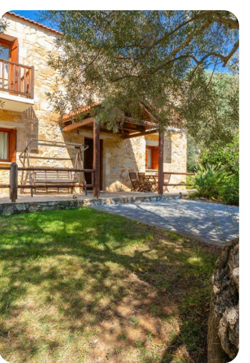
Villa Miguela | Page 6 of 8