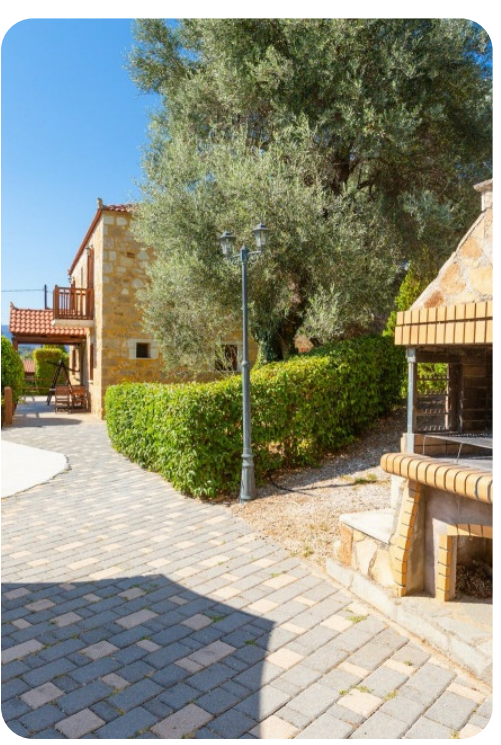
Villa Miguela | Page 5 of 8