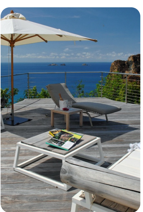
Villa Mia | Page 8 of 8