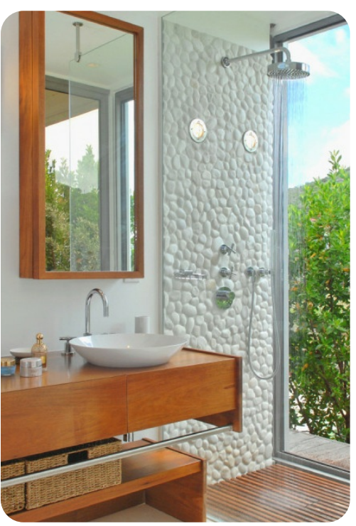
Villa Mia | Page 2 of 8