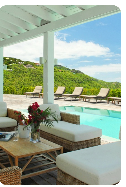
Villa Mia | Page 5 of 8