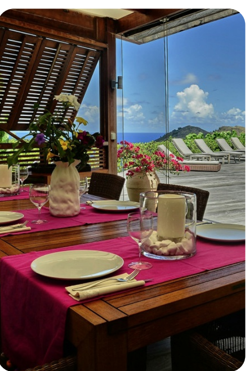
Villa Mia | Page 7 of 8