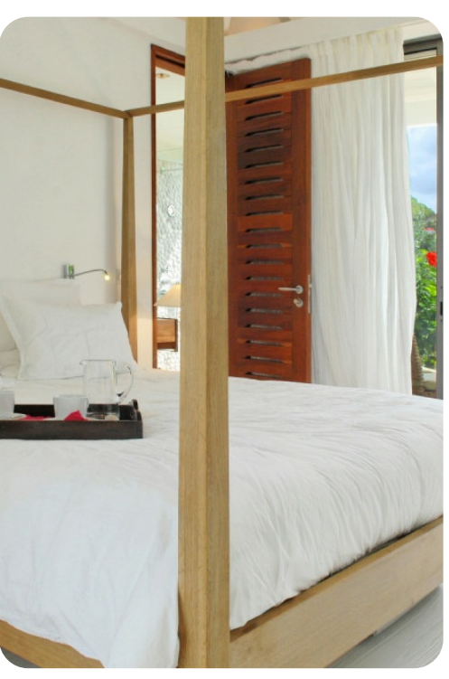
Villa Mia | Page 3 of 8