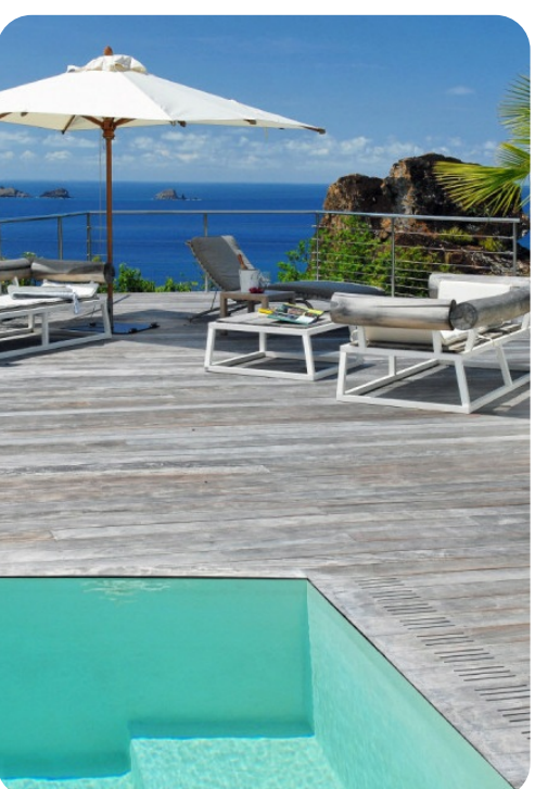
Villa Mia | Page 6 of 8