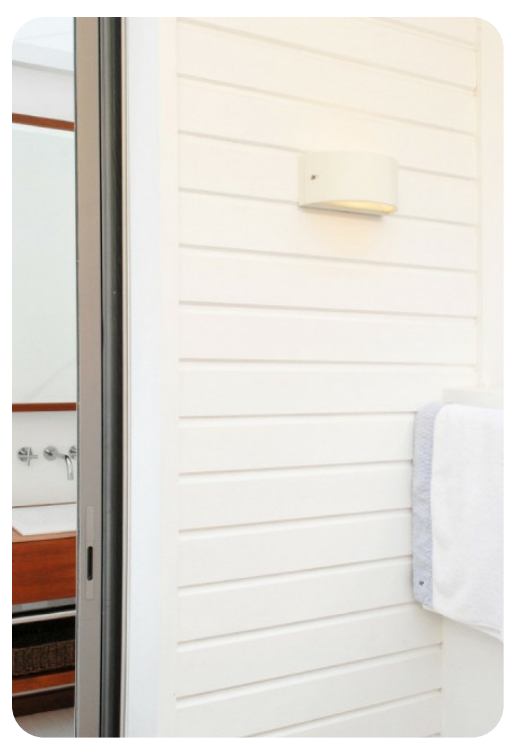
Villa Mia | Page 4 of 8