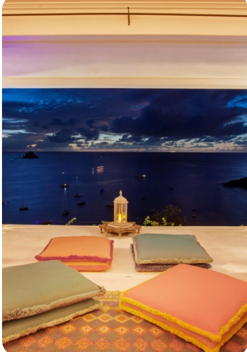
Villa Mauresque | Page 2 of 8