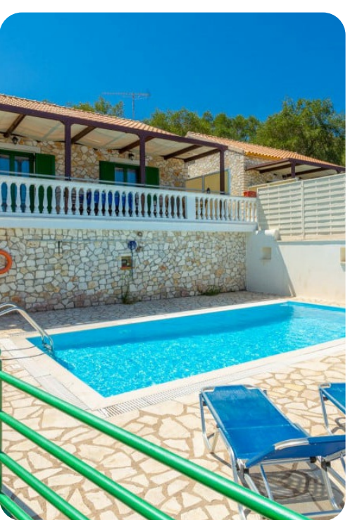
Villa Martha | Page 3 of 8