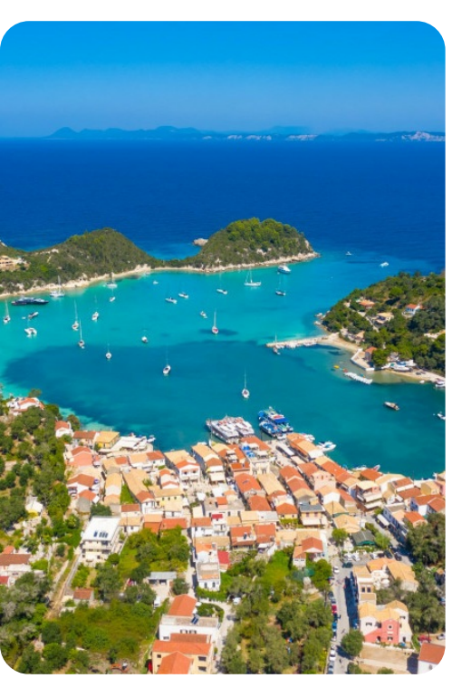
Villa Martha | Page 7 of 8