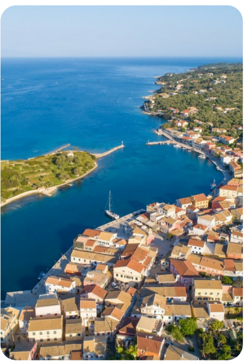
Villa Martha | Page 6 of 8