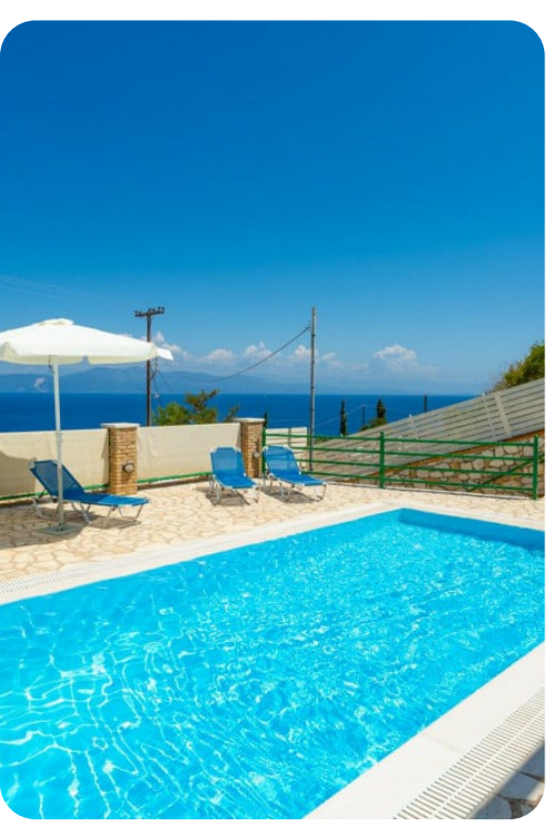
Villa Martha | Page 5 of 8