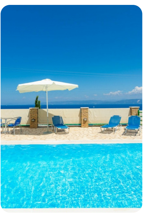
Villa Martha | Page 4 of 8