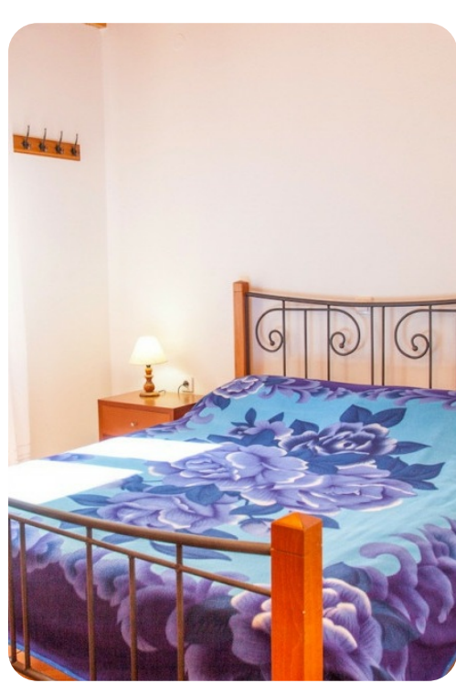
Villa Martha | Page 2 of 8