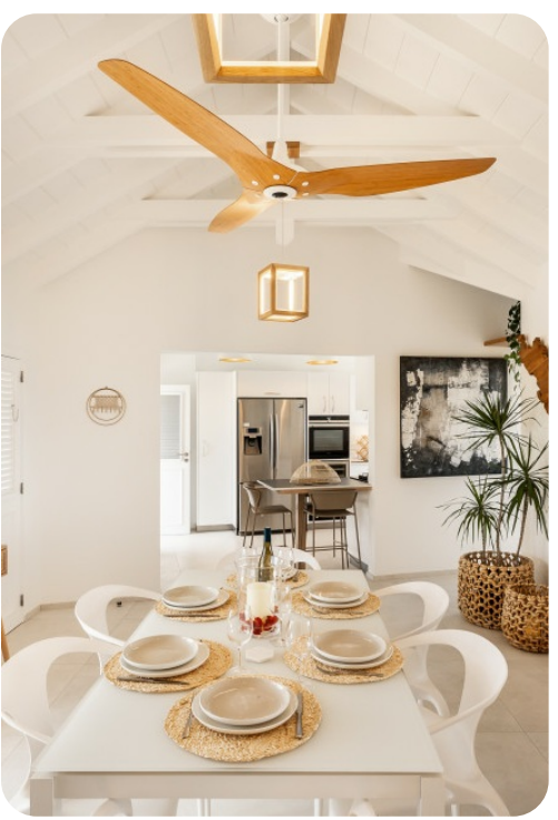
Villa Marris | Page 2 of 7