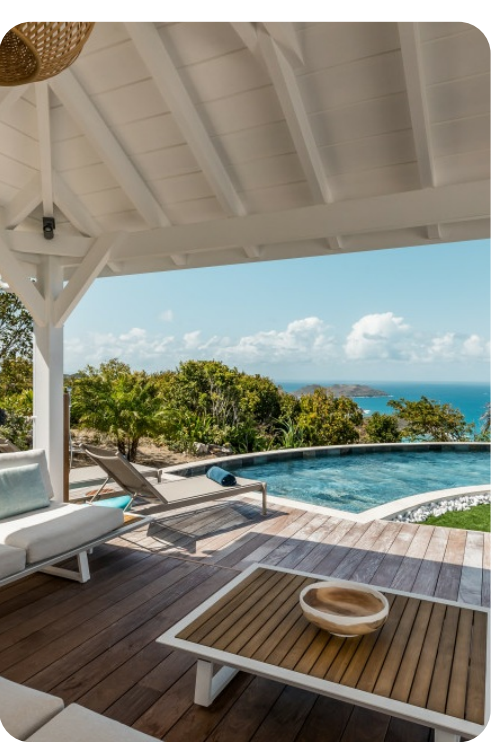
Villa Marris | Page 6 of 7