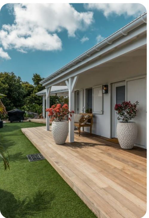
Villa Marris | Page 5 of 7