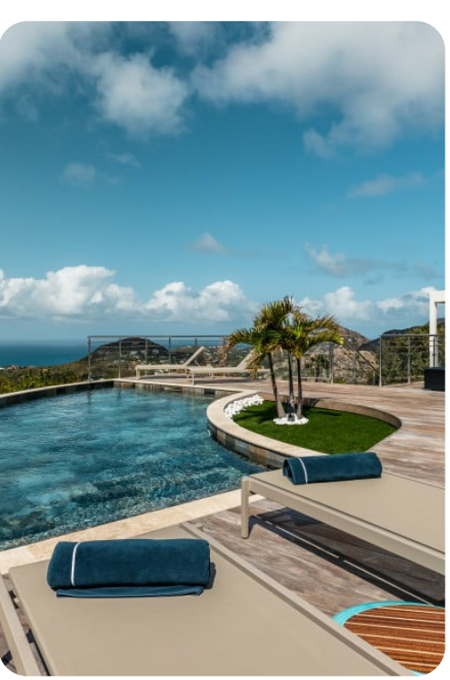
Villa Marris | Page 7 of 7