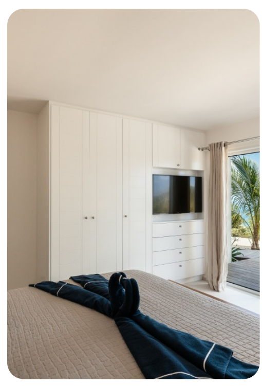
Villa Marris | Page 4 of 7