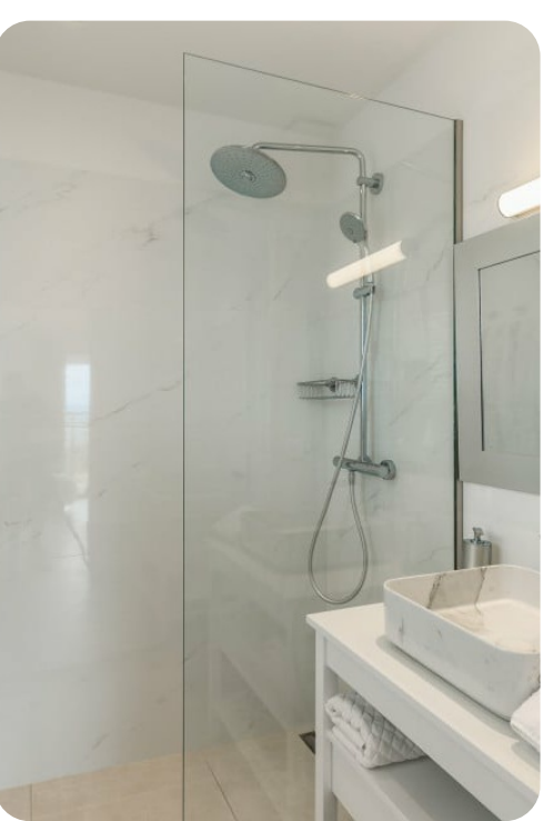
Villa Marris | Page 3 of 7