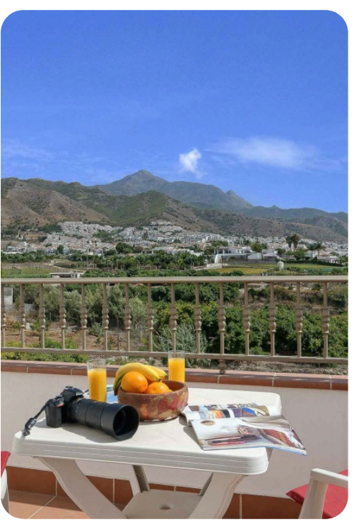
Villa Mango - Nerja | Page 2 of 5