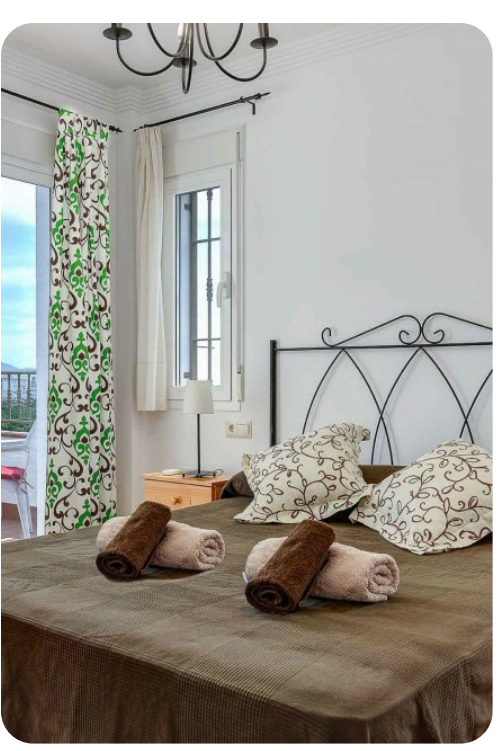
Villa Mango - Nerja | Page 4 of 5