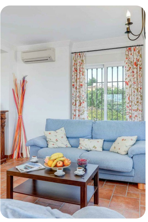
Villa Mango - Nerja | Page 3 of 5