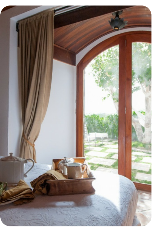
Villa Maison Mexicaine | Page 4 of 7