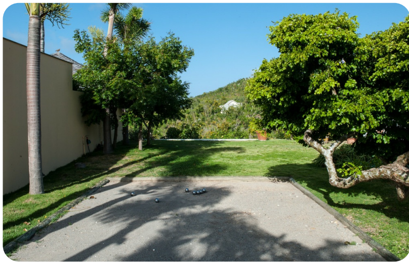
Villa Maison Mexicaine | Page 1 of 7