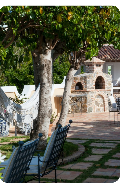
Villa Maison Mexicaine | Page 6 of 7