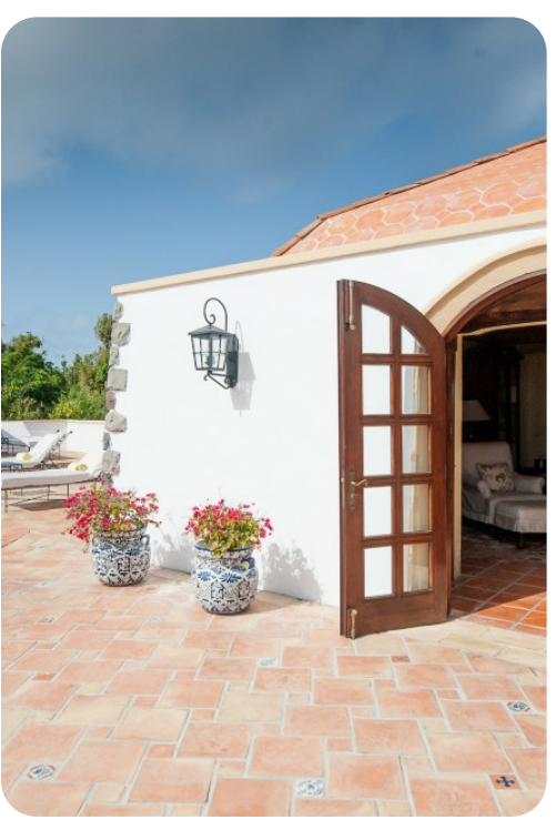
Villa Maison Mexicaine | Page 5 of 7