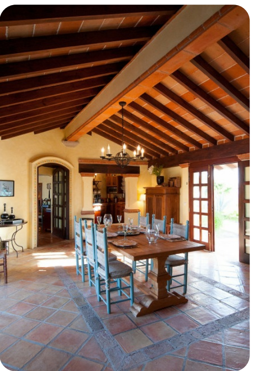
Villa Maison Mexicaine | Page 2 of 7