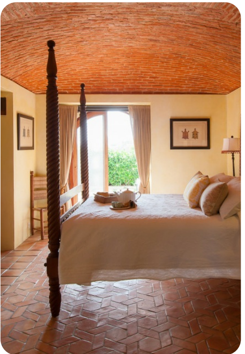
Villa Maison Mexicaine | Page 3 of 7