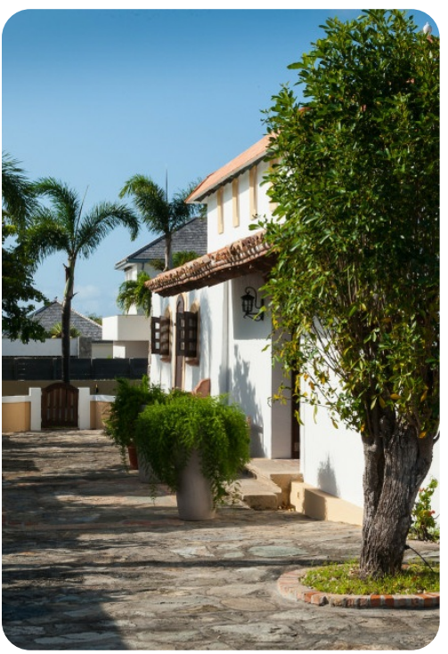
Villa Maison Mexicaine | Page 7 of 7